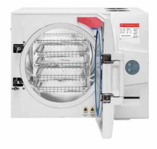
Loaded with 5 stainless steel trays

Loaded vertically with 4 full and 4 half cassettes (cassette rack included)