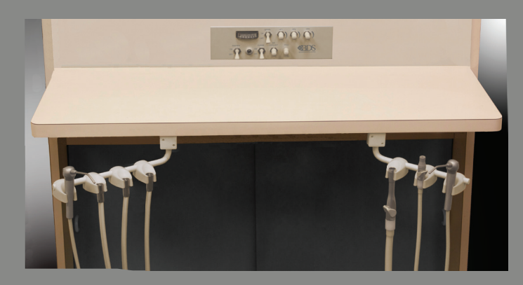
Panel mount dimensions (w x h x d) (9-3/4" \times 2-3/4" \times 9-7/8")