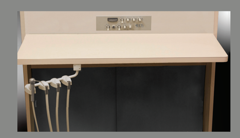
Panel mount dimensions (w x h x d) (9-3/4" \times 2-3/4" \times 9-7/8")