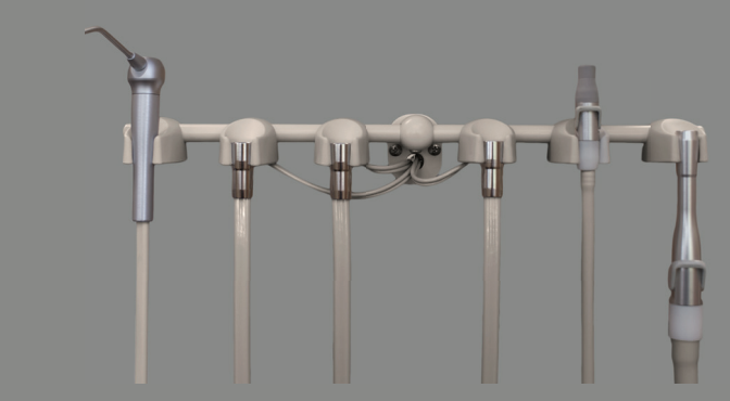
Panel mount dimensions (w x h x d) (9-3/4" x 2-3/4" x 9-7/8")