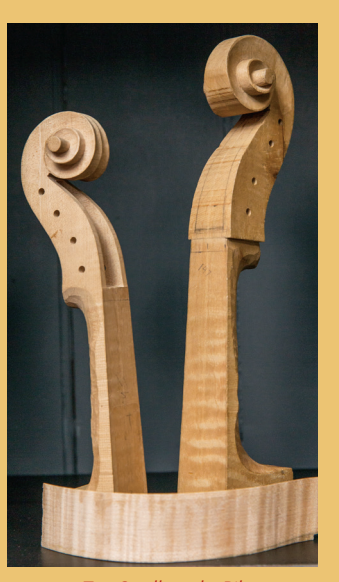
Two Scrolls and a Rib