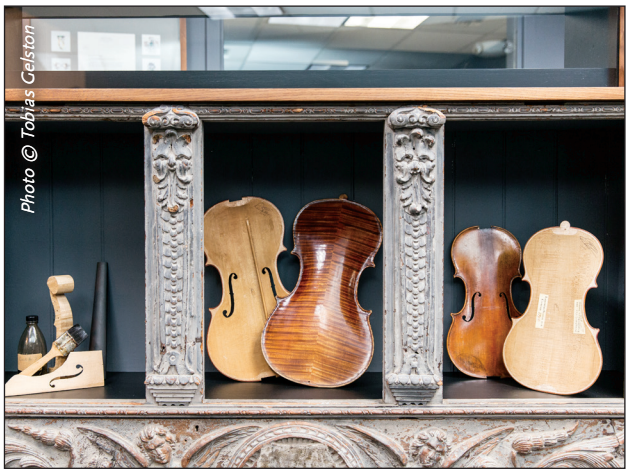
The Art & Craft of the Violin Show at the Master Craft Gallery

as part of the show built on the excitement of this experiential and linguistic challenge. These events allowed me to understand more deeply the subjective experience of the listener as well as the player. I hope we can share some of that excitement in this edition of The Scroll.