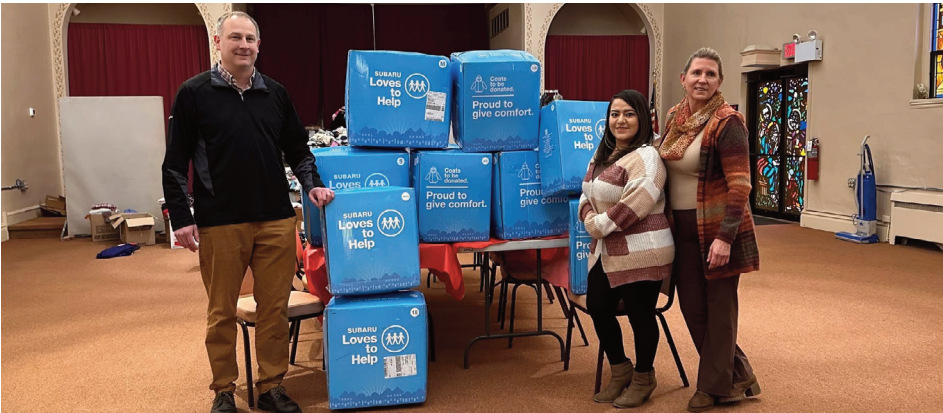
Fairway Subaru are proud to participate in the Subaru Loves to Help initiative to give back to our community. Through our partnership with Operation Warm, we're working with St. Joseph's Food Pantry to donate brand-new coats to children in urgent need. #SubaruLovesToHelp