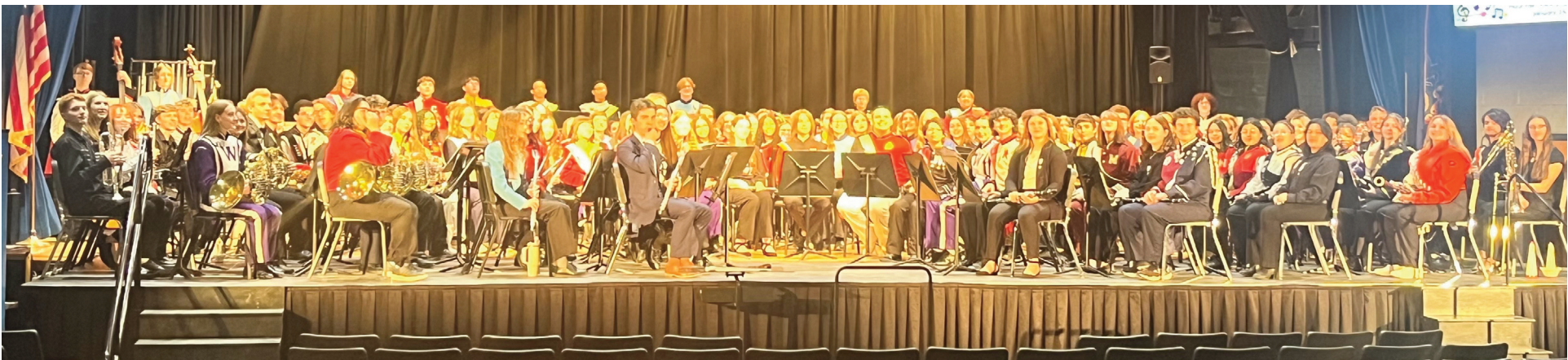
The PMEA District 9 Band Festival weekend concluded with a public performance.