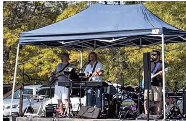
Mother and Daughter enjoying Kartune entertaining at the Sacco Chiropractic Patient + Community Appreciation Day