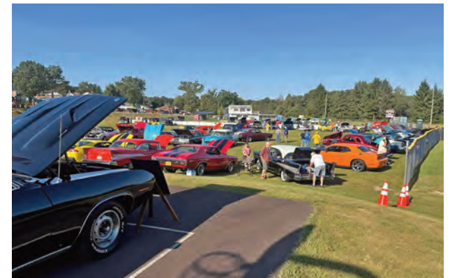
Anthracite Region ACA annual "See You in September" car show.

THIS COULD BE YOUR BANNER AD IN THE CENTERFOLD.