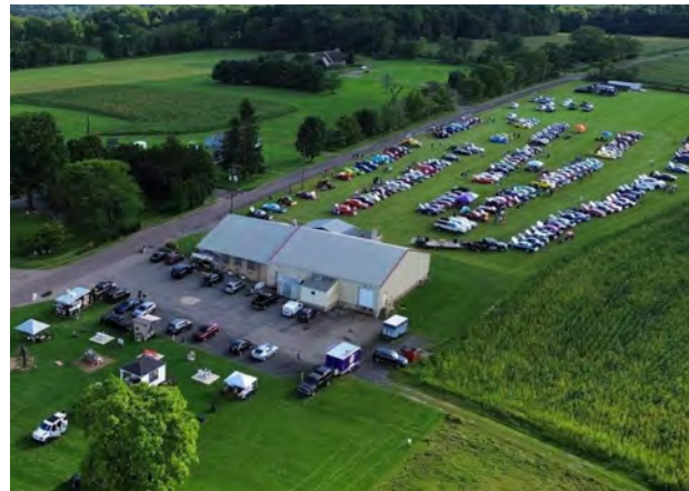
Pecora's Creamery first annual "Cars & Cones".