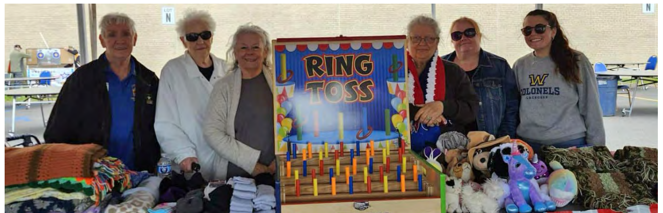
Members of Freeland VFW Post 5010 Auxiliary teamed up with other Post's auxiliary members to help facilitate a carnival at the Wilkes Barre VA Hospital on Sept. 8th.