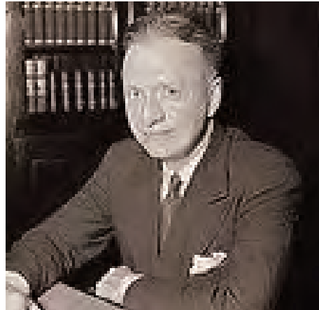
U.S. Representative Francis E. Walter (D-PA).

billions of gallons of runoff during major storm events.