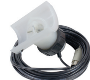
1-1/2" Paddle Flow Sensor