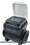
2" Magmeter Flow Sensor