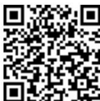
PayPal Scan Code

You can donate to any Social Ministry charities LMLC supports by scanning one of the codes with your smart phone and designating where you want your money to go.