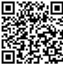
PayPal Scan Code

You can donate to Change for Change or any Social Ministry charities LMLC supports by scanning one of the codes with your smart phone and designating where you want your money to go.