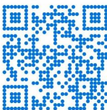
Venmo Scan Code