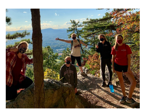
Students enjoy a break from zoom on a socially distant hike together