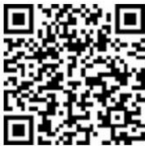
PayPal Scan Code

You can donate to Change for Change or any Social Ministry charities LMLC supports by scanning one of the codes with your smart phone and designating where you want your money to go.