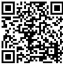
PayPal Scan Code QR Code has been updated.

You can donate to any Social Ministry charities LMLC supports by scanning one of the codes with your smart phone and designating where you want your money to go.