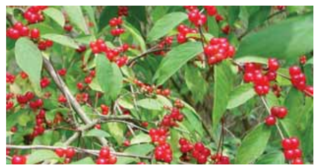
Fruits and leaves of amur honeysuckle