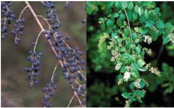
Fruit (left) and leaves and flowers (right) of Chinese privet.