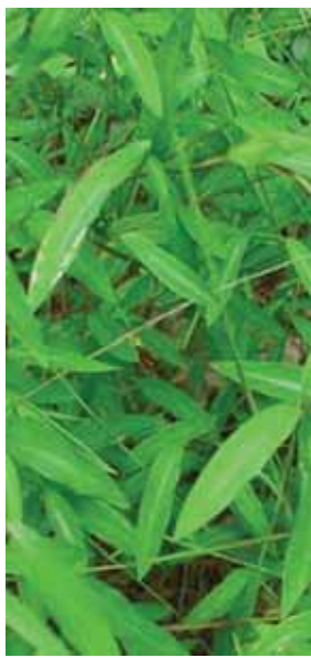
Chinese lespedeza (left) and Japanese grass (right)