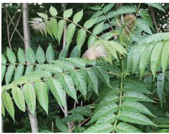
Leaves of the tree-of-heaven.

The vegetation historically found in a local area is termed native vegetation. These plants have traditionally been found in the area and are well-suited to maintain themselves in their environs. Exotic plants are those plants found in a particular area, but which originate from another continent or country. These plants can also be referred to as non-native. However, non-native plants are not always exotic. Non-native plants may also be native elsewhere in the same country, but not found in the local area. For example, redwoods are native to California and would be non-native in Tennessee, but not exotic. Invasive plants are plants, native, non-native or exotic, that can cause significant ecological or economic damage. Invasive plants can displace more ecologically and economically valuable plants. These plants are typically characterized by a rampant rate of spread. This rate of dispersal is due to both human activity and vegetative characteristics. Humans assist in the dispersal of plants by moving plant materials to and from locations. Humans also cause significant dis-