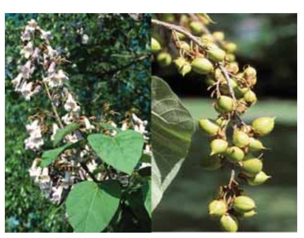
Flowers and leaves (left) and seed pod (right) of royal paulownia.

The introduction of many non-native or exotic plants has occurred both intentionally, as with ornamental plantings, and accidentally, as a by-product of commerce. For example, the movement of hay, carrying seeds of invasive plants, can introduce exotic and/or non-native invasive plants to new areas. Intentional plantings occur in both ornamentals, whose foliage, form and/or flowers make them attractive additions to landscaping, and other plants introduced to be used as erosion control or wildlife forage. Often, these plants exhibit reproductive traits that enable them to spread rapidly.