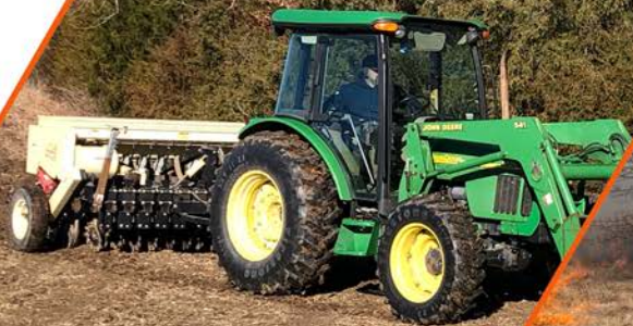
NATIVE SEED INSTALL