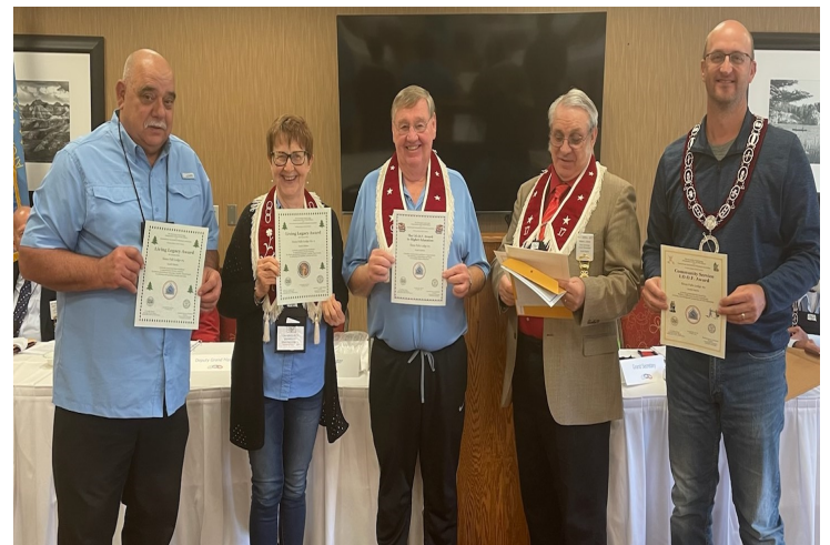
Sioux Falls Lodge #9 receives Sovereign Grand Lodge recognition certificates for the Living Legacy program, the Education program and the Community Service program.

Gregory Lodge receives SGL Certificate for ?? I will let you know in the next issue of the Pasque!! Someone forgot to write it down. I don't know who that could have been??