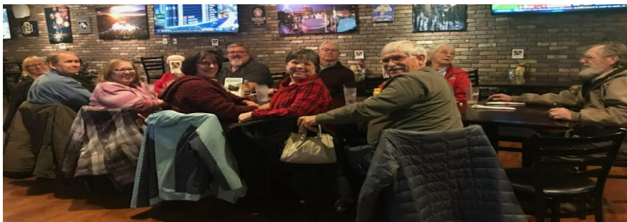
Rushmore Lodge #39-Christmas party