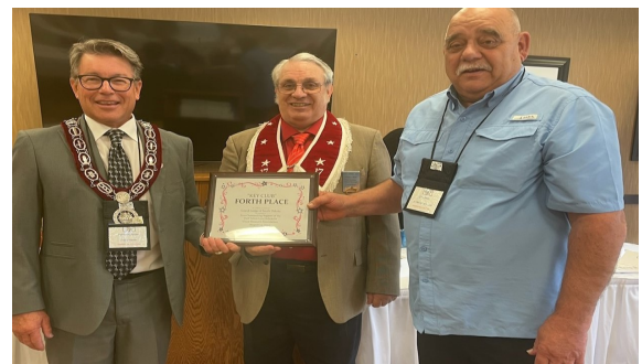
South Dakota Grand Lodge receives a Key Club Award for Visual Research. Also, Pilgrimage for Youth, Education certificates from Sovereign Grand Lodge. We also received a thank you from the Arthritis Foundation for our contributions to the Sovereign Grand Lodge Programs

Gregory Lodge receives SGL Certificate for ?? I will let you know in the next issue of the Pasque!! Someone forgot to write it down. I don't know who that could have been??