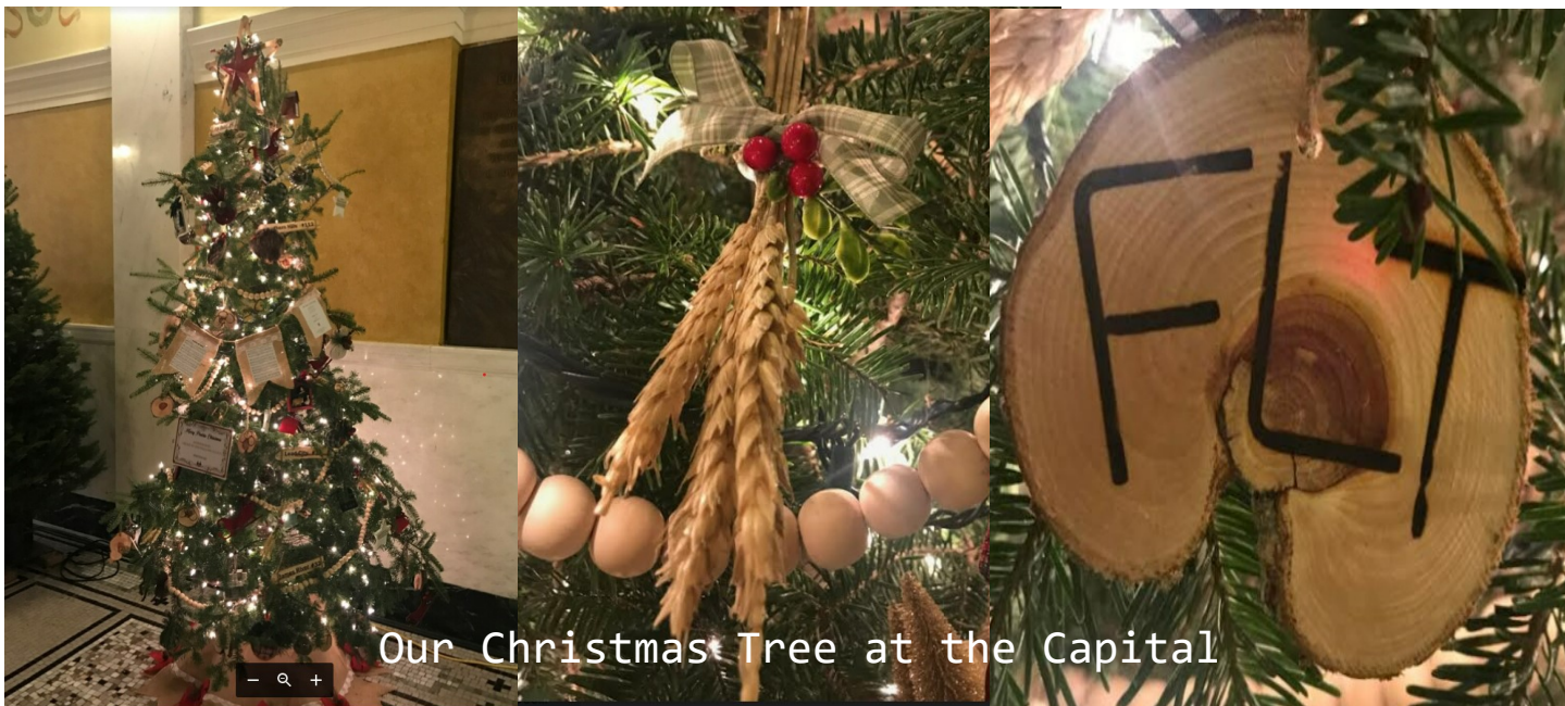
Our Christmas Tree at the Capital