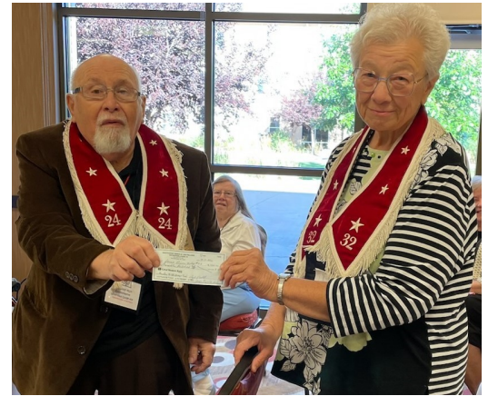
Donation from Watertown #24 to James River #32 for Cemetery clean up after the summers wind storms