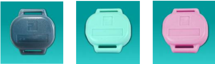
T-7000 Bracelet Tags

The T-7000 Personnel Bracelet Tag is a Long Range RFID tracking bracelet used in Patient, Medical and other real time Occupational Health and Safety Tracking Applications