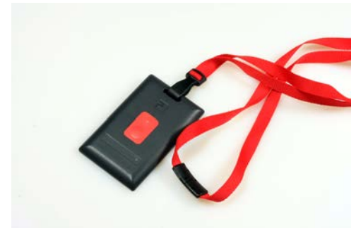
T-9050 Duress Tag on a Lanyard

Also available is the T-9050 Duress Badge Tag which includes a built-in membrane push button for manual safety applications such as nurse duress, emergency help, manufacturing machine stop, and various Lone Worker Protection applications.