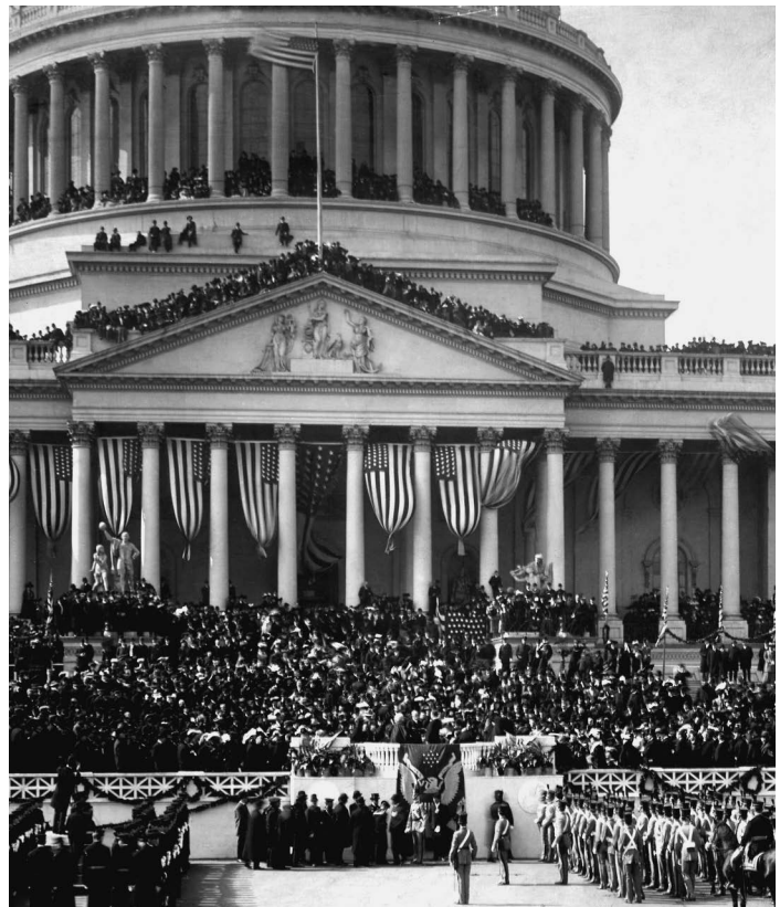
The inauguration of President Theodore Roosevelt on March 4, 1905.

For more information about the vice president of the United States, visit whitehouse.gov .