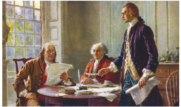
Benjamin Franklin, John Adams, and Thomas Jefferson in “Writing the Declaration of Independence, 1776,” by Jean Leon Gerome Ferris.

The Declaration of Independence lists three rights that the Founding Fathers considered to be natural and “unalienable.” They are the right to life, liberty, and the pursuit of happiness. These ideas about freedom and individual rights were the basis for declaring America’s independence. Thomas Jefferson and the other Founding Fathers believed that people are born with natural rights that no government can take away. Government exists to protect these rights. Because the people voluntarily give up power to a government, they can take that power back. The British government was not protecting the rights of the colonists, so the colonies took back their power and separated from Great Britain.