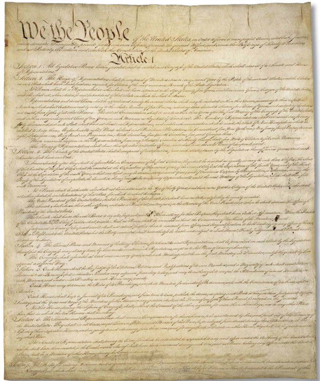
The Constitution of the United States.

The Constitution, written in 1787, created a new system of U.S. government—the same system we have today. James Madison was the main writer of the Constitution. He became the fourth president of the United States. The U.S. Constitution is short, but it defines the principles of government and the rights of citizens in the United States. The document has a preamble and seven articles. Since its adoption, the Constitution has been amended (changed) 27 times. Three-fourths of the states (9 of the original 13) were required to ratify (approve) the Constitution. Delaware was the first state to ratify the Constitution on December 7, 1787. In 1788, New Hampshire was the ninth state to ratify the Constitution. On March 4, 1789, the Constitution took effect and Congress met for the first time. George Washington was inaugurated as president the same year. By 1790, all 13 states had ratified the Constitution.