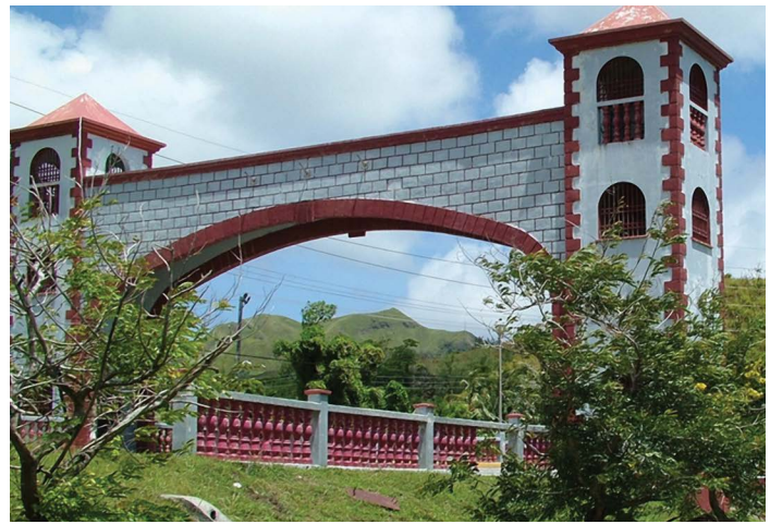
Old Spanish Bridge in Umatac, Guam.

The northern border of the United States stretches more than 5,000 miles from Maine in the East to Alaska in the West. There are 13 states on the border with Canada. The Treaty of Paris of 1783 established the official boundary between Canada and the United States after the Revolutionary War. Since that time, there have been land disputes, but they have been resolved through treaties. The International Boundary Commission, which is headed by two commissioners, one American and one Canadian, is responsible for maintaining the boundary.