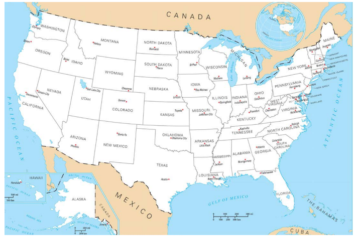
Map of the United States including state capitals. Courtesy of the National Atlas of the United States, March 5, 2003, http://nationalatlas.gov .

The Constitution did not establish political parties. President George Washington specifically warned against them. But early in U.S. history, two political groups developed. They were the Democratic-Republicans and the Federalists. Today, the two major political parties are the Democratic Party and the Republican Party. President Andrew Jackson created the Democratic Party from the Democratic-Republicans. The Republican Party took over from the Whigs as a major party in the 1860s. The first Republican president was Abraham Lincoln. Throughout U.S. history, there have been other parties. These parties have included the Know-Nothing (also called American Party), Bull-Moose (also called Progressive), Reform, and Green parties. They have played various roles in American politics. Political party membership in the United States is voluntary. Parties are made up of people who organize to promote their candidates for election and to promote their views about public policies.