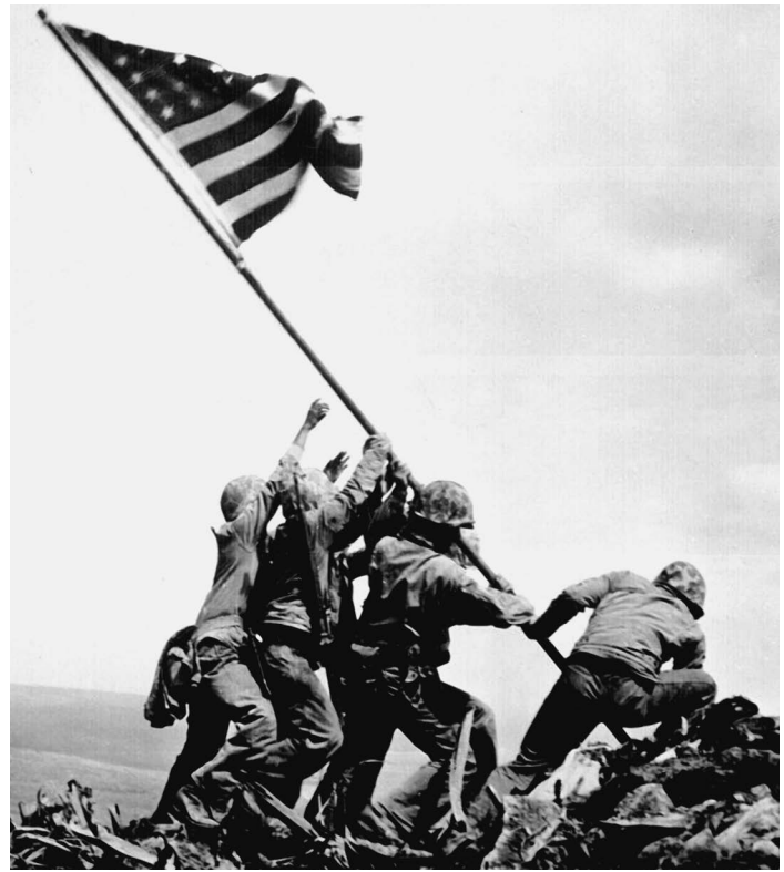
“Raising the Flag on Iwo Jima,”, 1945.

From 1959 to 1975, United States Armed Forces and the South Vietnamese Army fought against the North Vietnamese in the Vietnam War. The United States supported the democratic government in the south of the country to help it resist pressure from the communist north. The war ended in 1975 with the fall of Saigon, the capital of South Vietnam. In 1976,