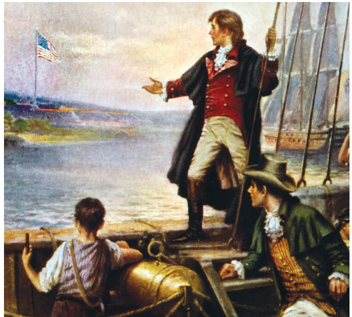
In "The Star-Spangled Banner," by Percy Moran, Francis Scott Key reaches toward the flag flying over Fort McHenry.

Many Americans celebrate national or federal holidays. These holidays often honor people or events in our American heritage. These holidays are "national" in a legal sense only for federal institutions and in the District of Columbia. Typically, federal offices are closed on these holidays. Each state can decide whether or not to celebrate the holiday. Businesses, schools, and commercial establishments may choose whether or not to close on these days. Since 1971, federal holidays are observed on Mondays except for New Year's Day, Independence Day, Veterans Day, Thanksgiving, and Christmas.