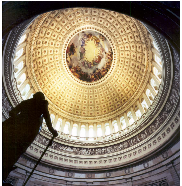
The Rotunda of the U.S. Capitol.

Congress is divided into two parts—the Senate and the House of Representatives. Because it has two “chambers,” the U.S. Congress is known as a “bicameral” legislature. The system of checks and balances works in Congress. Specific powers are assigned to each of these chambers. For example, only the Senate has the power to reject a treaty signed by the president or a person the president chooses to serve on the Supreme Court. Only the House of Representatives has the power to introduce a bill that requires Americans to pay taxes.