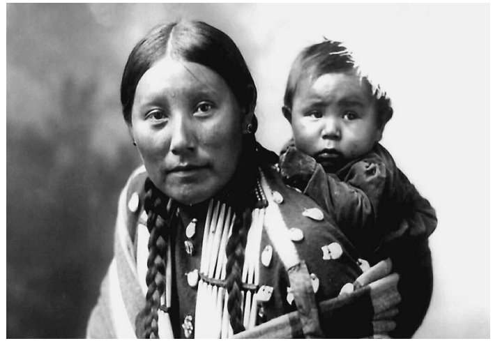
American Indian woman and her baby in 1899. Courtesy of the Library of Congress, LC-USZ62-94927.

On September 11, 2001, four airplanes flying out of U.S. airports were taken over by terrorists from the Al-Qaeda network of Islamic extremists. Two of the planes crashed into the World Trade Center’s Twin Towers in New York City, destroying both buildings. One of the planes crashed into the Pentagon in Arlington, Virginia. The fourth plane, originally aimed at Washington, D.C., crashed in a field in Pennsylvania. Almost 3,000 people died in these attacks, most of them civilians. This was the worst attack on American soil in the history of the nation.