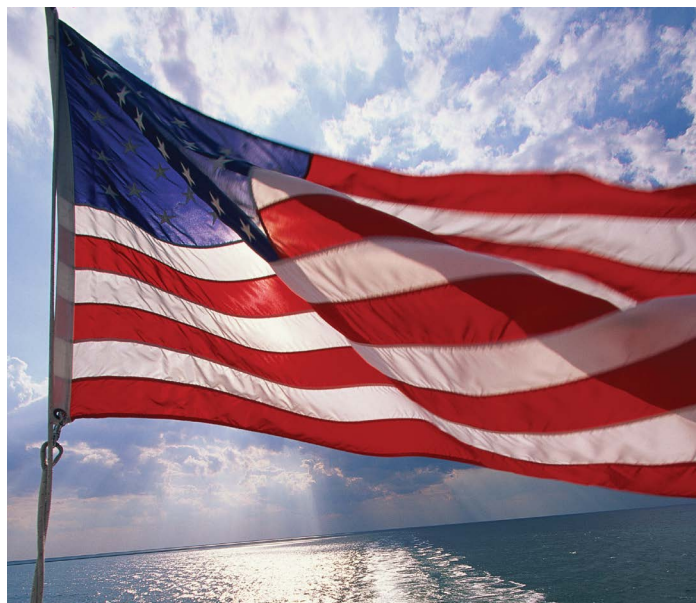
The American flag is an important symbol of the United States.

U.S. citizens have the right to vote in federal elections. Permanent residents can vote in local or state elections that do not require voters to be U.S. citizens. Only U.S. citizens can vote in federal elections. U.S. citizens can also run for federal office. Qualifications to run for the Senate or House of Representatives include being a U.S. citizen for a certain number of years. A candidate for Senate must be a U.S. citizen for at least 9 years. A candidate for the House must be a U.S. citizen for at least 7 years. To run for president of the United States, a candidate must be a natural-born (not naturalized) citizen. In addition to the benefits of citizenship, U.S. citizens have certain responsibilities—to respect the law, stay informed on issues, participate in the democratic process, and pay their taxes.