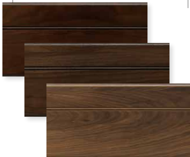
Top to Bottom: Walnut, Cocoa stain, Onyx glaze; Walnut, Shale stain, Sable glaze; Walnut, Ashen stain, Caramel glaze

The Truetone Sample Chip Kit has been modified to include Walnut chips with Ashen, Cocoa and Shale finishes without glaze. A complete listing of the Truetone species and color options are in Section 8 of the Custom Product Manual.