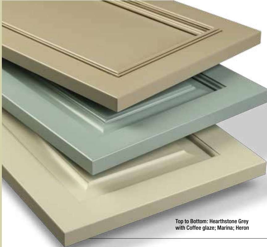
Top to Bottom: Hearthstone Grey with Coffee glaze; Marina; Heron