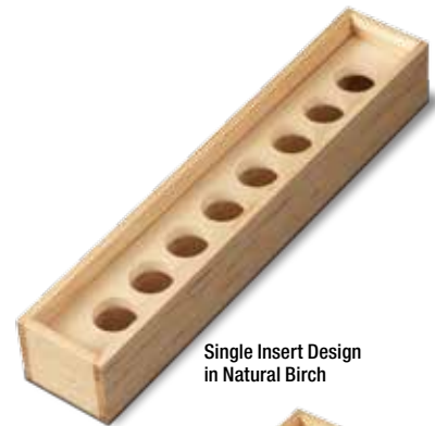
Single Insert Design in Natural Birch