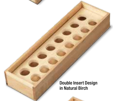
Double Insert Design in Natural Birch