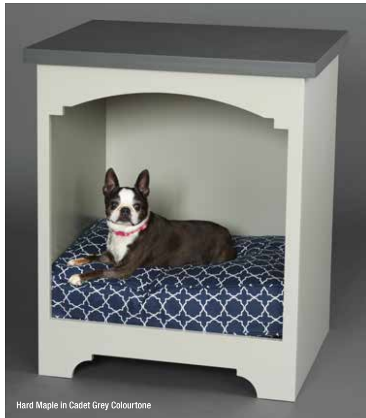
Hard Maple in Cadet Grey Colourtone

Combine either of these units with options such as Shaped Side or Prepare for False Door side to produce a truly remarkable accent piece on your next project. See Section 6, Base Cabinets in our Cabinet Systems Manual for details.