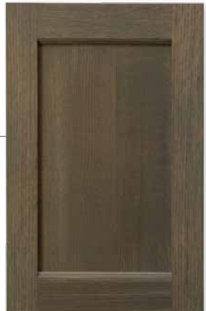
Quarter Sawn White Oak in Driftwood stain