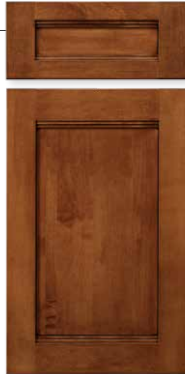
Hard Maple, Honey stain, Sable glaze

As transitional and contemporary tendencies in kitchen designs remain at the forefront, Conestoga introduces this striking door style that functions well in multiple design arenas. The Glasgow door and drawer front provides a unique profile combination with square bead stiles and a simple, yet prominent double stepped framing bead on the 3" wide rails. Information for the Glasgow door and other mortise & tenon designs can be in Section 4 of the Custom Product Manual.