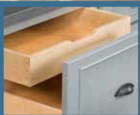
Rollout Cabinet Systems