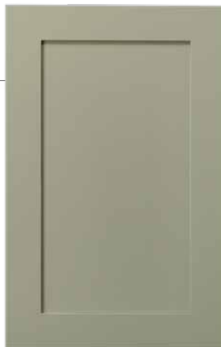
MDF in Cadet Grey

Material pricing for this new design is based on 1-Piece MDF, which represents a savings of $1.55 list per square foot compared to 1SPG MDF. See page 5.4 for details about the entire SQF series.