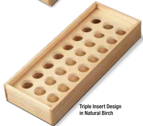
Triple Insert Design in Natural Birch