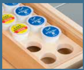
Beverage Pod Insert