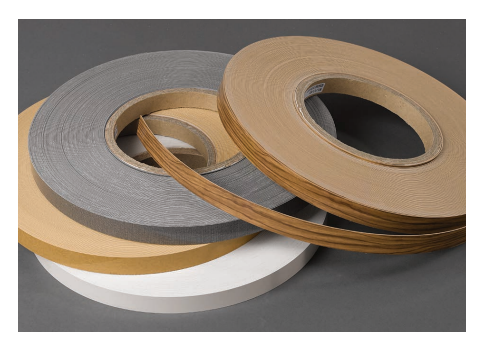
Rolls of matching edgeband in all colors.