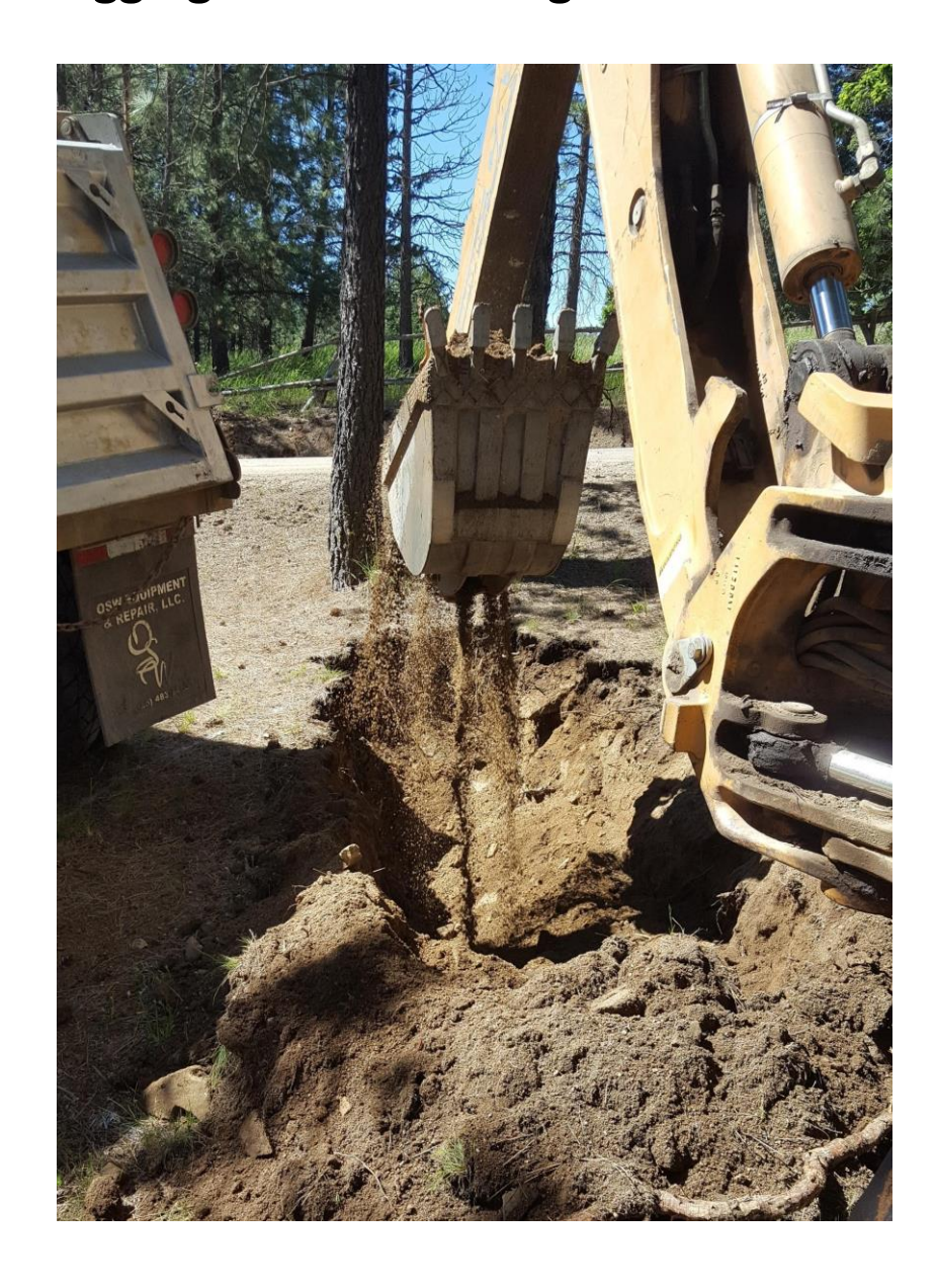
Digging and Rock Filling LSH Road 1A Dry Well to Allow Rainwater Drainage to prevent road damage