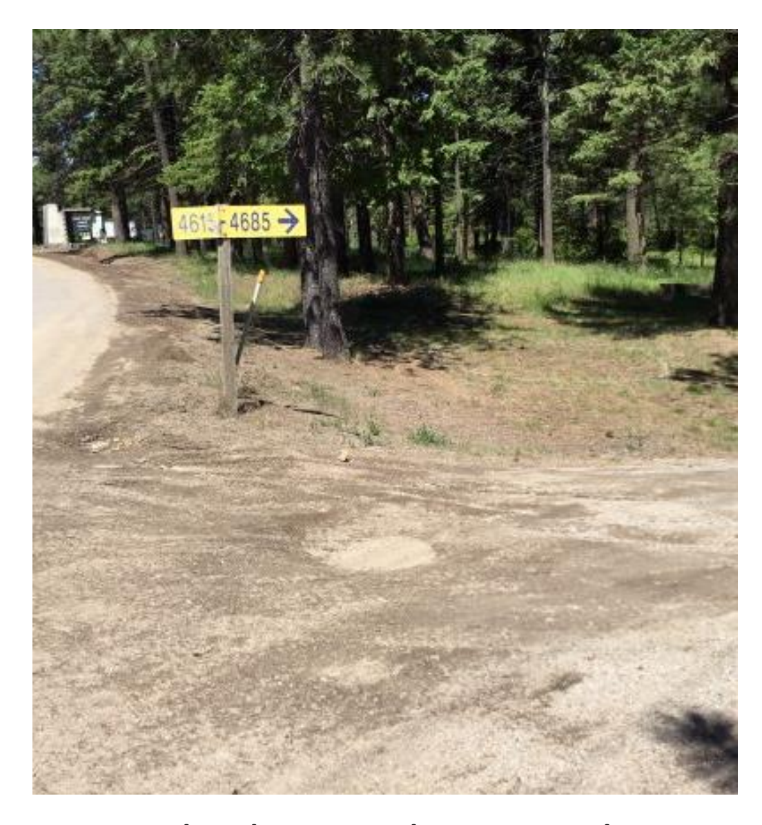
S. Loon Lake Rd – LSH Road 1 Entrance. There is sewer (large circle), gas line and communications lines running down the road