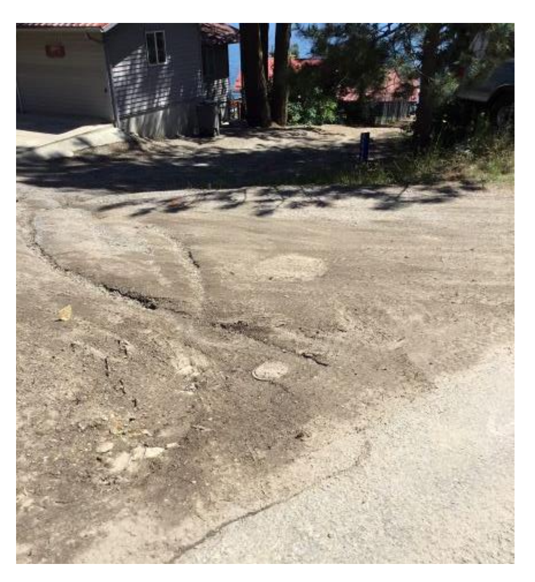
The water damage and erosion caused by the May 30<sup>th</sup> thunderstorm flowing down road 1 and into the Absolonson's driveway.