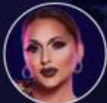
FALEASHA SAVAGE MISS GAY UNITED STATES 2014 MISS GAY UNITED STATES ICON 2017