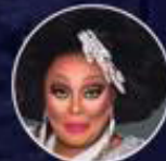
JUSTICE PAGE COUNCE