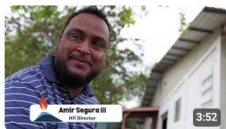
2025 New Cafeteria at LLAH