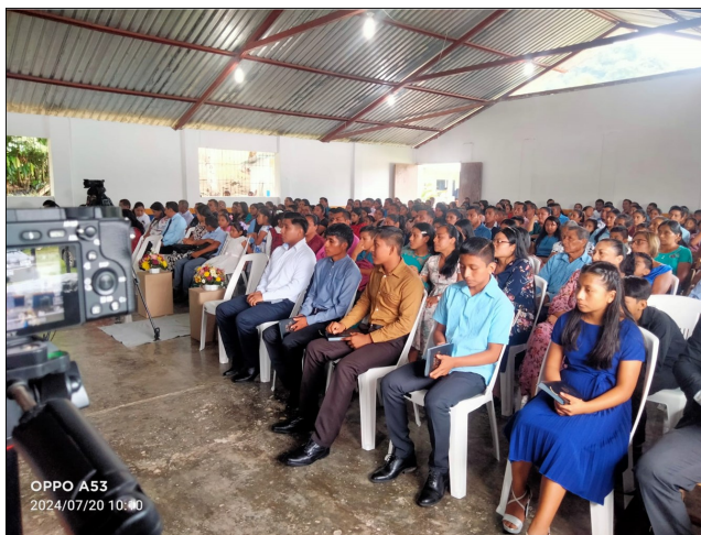
Crowded auditorium during recent event