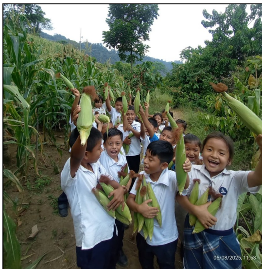
Happy CoVeCa students Story page 4

Let your light so shine before men, that they may see your good works, and glorify your Father which is in heaven. Matthew 5:16