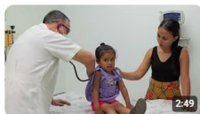
La Loma Luz Hospital 2025 Promo