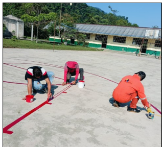
Painting the court

To support the mission of Colegio Venustiano Carranza, mark your gift “San Lorenzo School” to double the results of your generosity! ♦