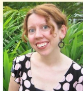
Wendy (East Asia)

Online registration is available at EventBrite.com/Spring Refresh 2018 , as well as mail in forms.