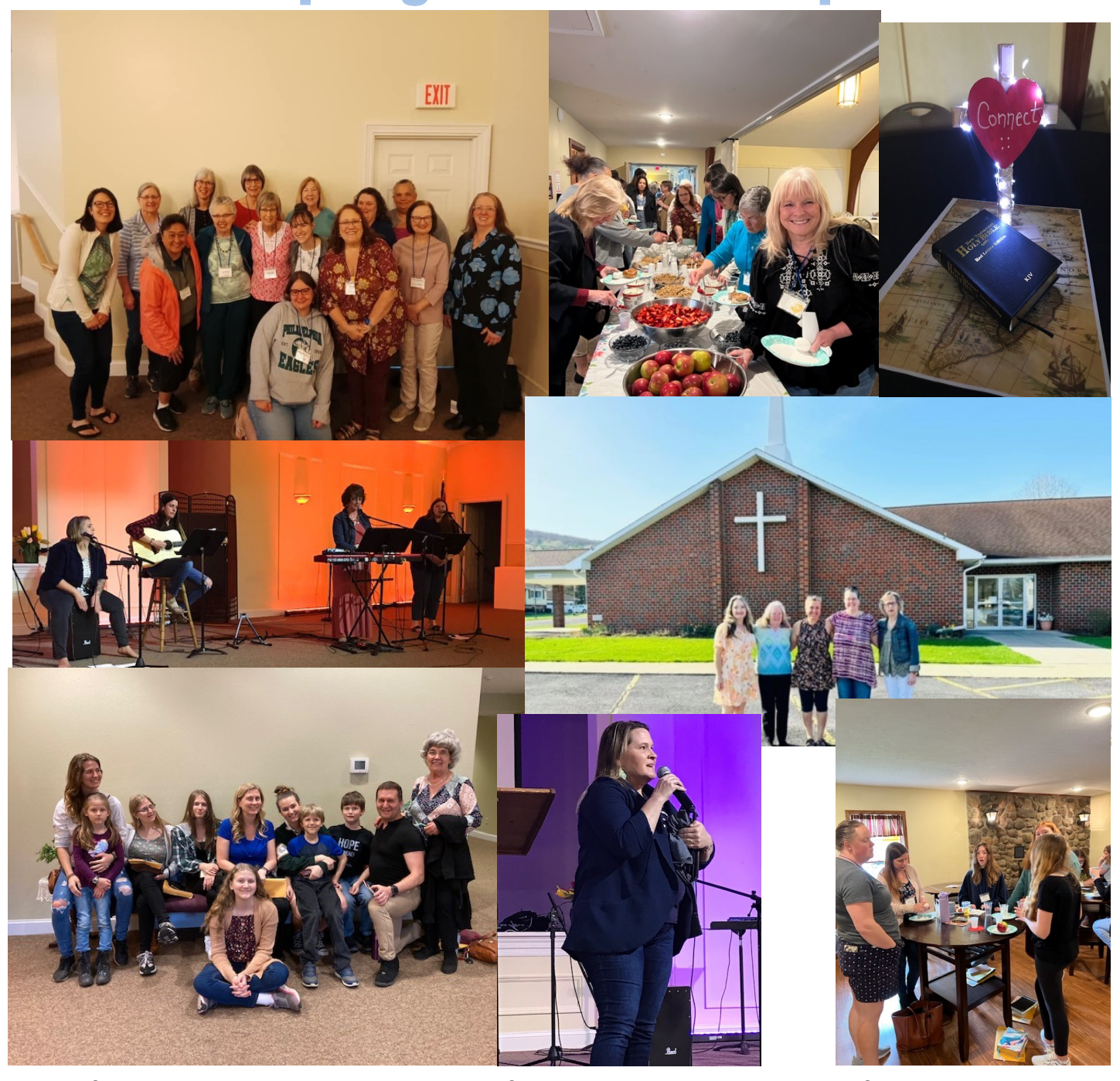
Thank you for your generosity in giving during Refresh. We were able to raise the following through your generous donations:

Friday evening's offering—$1,950.00 which helped cover expenses Saturday offering to Bongolo Hospital's Special Projects Fund—$2,760.71 Mercy Market Sales—$2,072.00 National Project through Potholder donations—$300.00