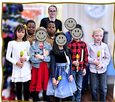
McTaggart Seniors Residence