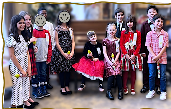
Lewis Estates Seniors Residence