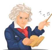
Ludwig van Beethoven

"To play a wrong note is insignificant; to play without passion is inexcusable."