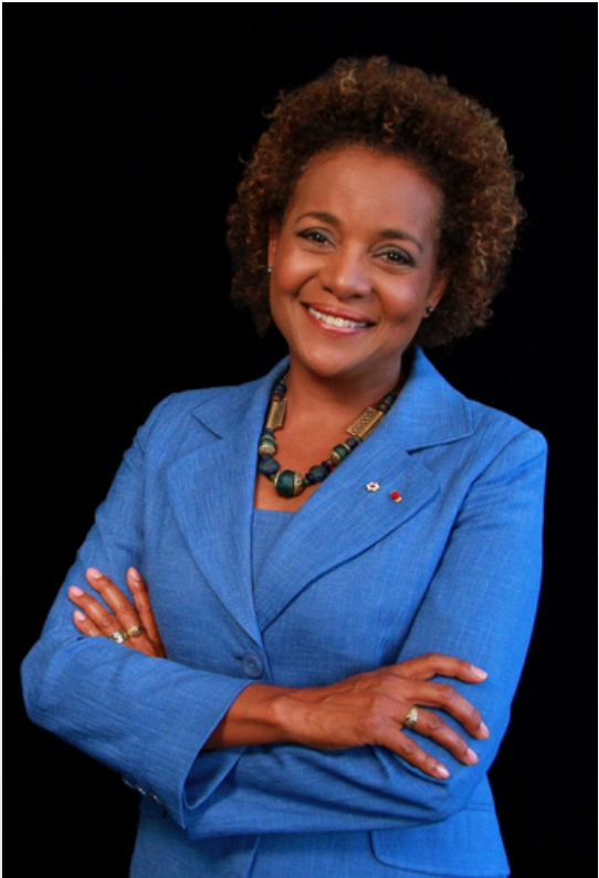
The Right Honourable Michaëlle Jean, PC, CC, CMM, COM, DStJ, CD, Governor General of Canada (2005 - 2010)

The 27th Governor General of Canada, Michaëlle Jean became the first person of Haitian descent to hold this position. Her tenure, which ended in 2010, was marked by her commitment to youth, culture, and reconciliation. Arriving in Canada in the 1960s after her family fled the Haitian dictatorship, Michaëlle Jean distinguished herself with her exceptional journey. She taught Italian at the University of Montreal and played an active role in creating emergency shelters for women victims of domestic violence in Quebec. Prior to her viceregal role, she had a distinguished career in journalism at Radio-Canada, where she hosted news programs and major reports.