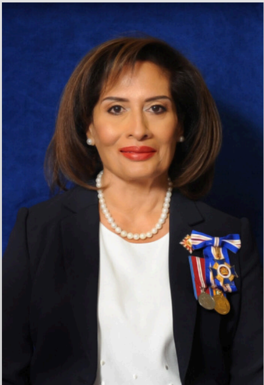
Her Honour, the Honourable Salma Lakhani, DStJ, AOE, Lieutenant Governor of Alberta (2020 - present)

In other words, the Governor General and the Lieutenant Governors are the "eyes and ears" of the King and are integral to the Canadian monarchy just as much as the King himself. Today, they represent a significant diversity in terms of gender, ethnic and cultural backgrounds, religion, as well as professions and occupations, as evidenced by these examples from Canadian history: