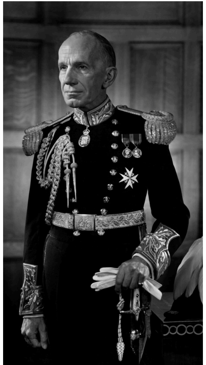
The Right Honourable Vincent Massey PC, CH, CC, KStJ, CD, FRSC(hon)

This shift began when the Right Honourable Vincent Massey became the first Canadian Governor General in 1952, marking the start of the monarchy taking on a distinctly Canadian identity. In 1959, the Right Honourable Georges Vanier succeeded him as the first Francophone to hold the position. Since then, Canada's viceregal representatives, including Governors General and Lieutenant Governors, have hailed from a wide range of backgrounds within our country.