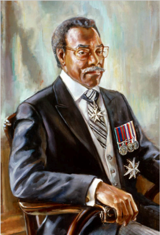
The Honourable Lincoln Alexander, PC, CC, KStJ, OOnt, CD, Lieutenant Governor of Ontario (1985 - 1991)

A politician, lawyer, and Canadian veteran, he served as a wireless operator in the Royal Canadian Air Force during World War II before earning a law degree. In 1968, he made history by becoming Canada's first Black Member of Parliament, and later, the country's first Black federal cabinet minister. After a distinguished career, he was appointed Lieutenant Governor of Ontario in 1985, becoming the first Black person to hold a viceregal position in Canada. He served in this role until 1991, focusing on education, youth, and equal opportunities. Lincoln Alexander remains an iconic figure in the fight against racism and the promotion of diversity in Canada. His commitment and contributions continue to inspire current and future generations.