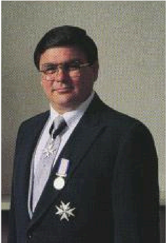
The Honourable W. Yvon Dumont, KStJ, OM, Lieutenant Governor of Manitoba (1993 - 1999)

An Indigenous leader and Canadian politician of Métis descent, Yvon Dumont was appointed Lieutenant Governor of Manitoba in 1993, becoming the first Métis person to hold a viceregal position in Canada. He served until 1999, highlighting the history and culture of the Métis while promoting dialogue and reconciliation between communities. Before his appointment, Yvon Dumont was actively involved in Indigenous politics. He was a founding member of the Assembly of First Nations and worked to defend the rights of Indigenous peoples, particularly the Métis, through his leadership in various organizations. His enduring contribution reflects his dedication to the recognition and empowerment of Indigenous peoples in Canadian society.