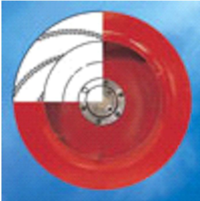
Clean Air Impeller - Type R

The clean air impeller is a closed bladed impeller with backward curved blades. This impeller is used for transport of clean air and of air with a small quantity of fine dust, such as welding smoke, oil mists or exhaust gases.