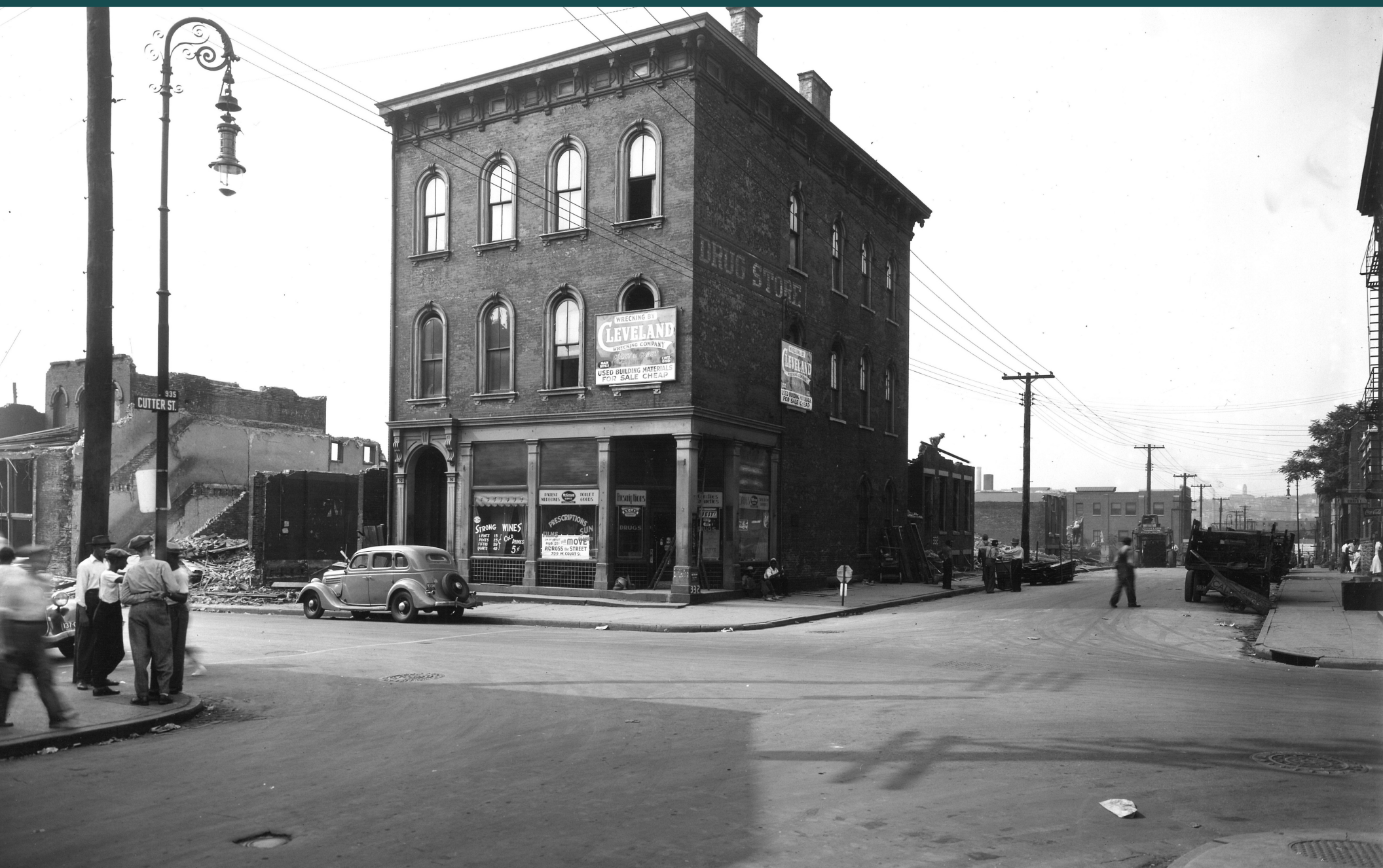
“Lincoln Court, September 2nd, 1941 – #6;” SC#59 – House by Subject – Housing Projects, Lincoln Court; Provided Courtesy of the Cincinnati Museum Center.

Lincoln Court Project, Ohio 4-4 Cincinnati Metropolitan Housing Authority Date: 6/27/41 No. 3