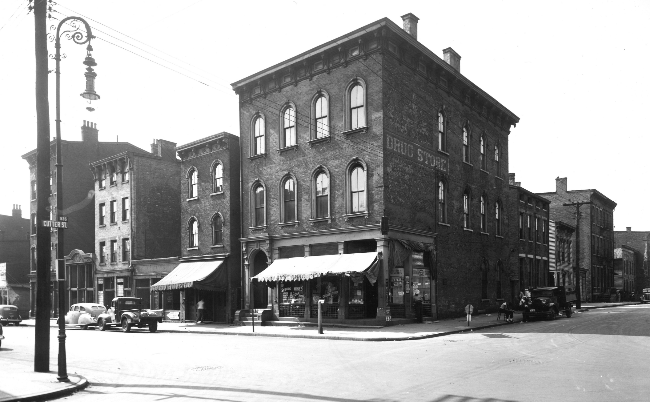
“Lincoln Court, June 27th, 1941 – #3;” SC#59 – House by Subject – Housing Projects, Lincoln Court; Provided Courtesy of the Cincinnati Museum Center.

Lincoln Court Project, Ohio 4-4 Cincinnati Metropolitan Housing Authority Date: 6/27/41 No. 3