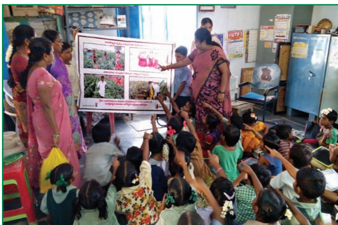
Create enthusiasm for children to learn