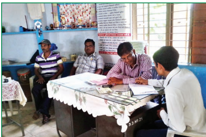
School visits to get more facts