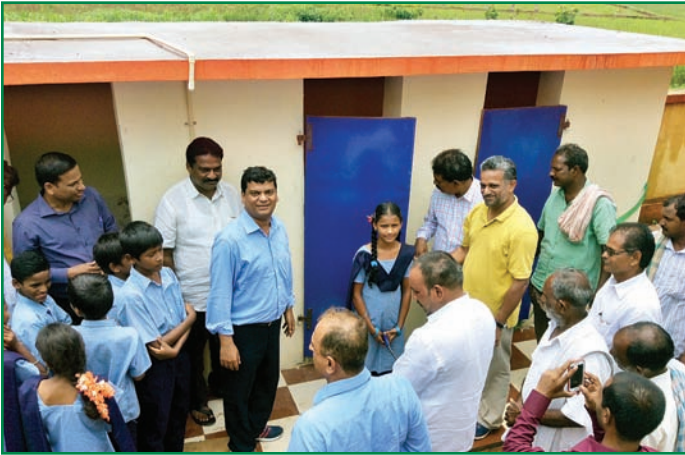
School sanitation facilities

A holistic approach makes program self sustained