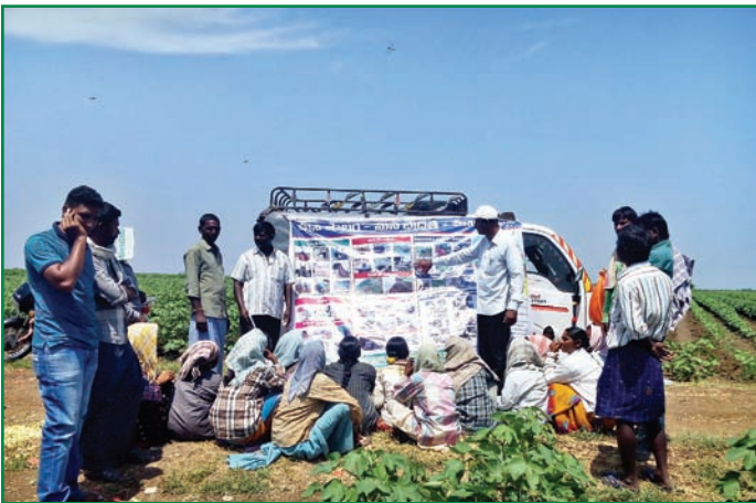
Farm labour training

More sensitization efforts lead to fewer audit requirements