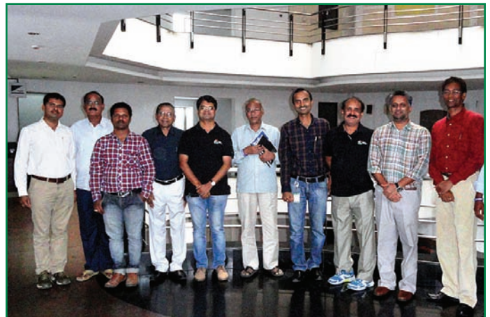
Steering committee to drive the program