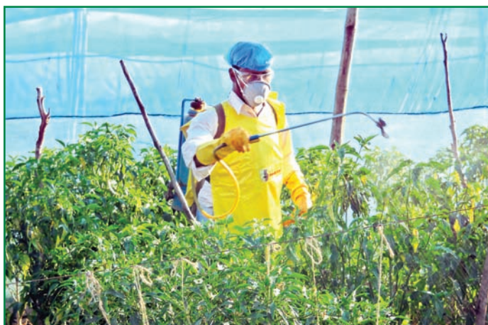
Personal protection for pesticide exposure