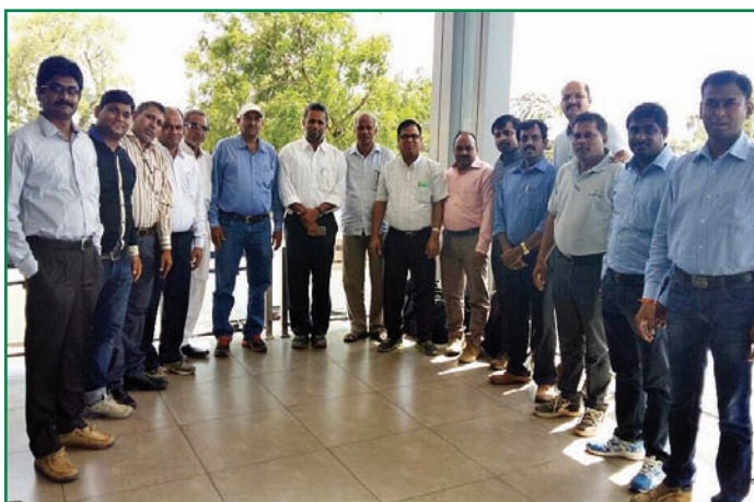
Collaborate with seed industry