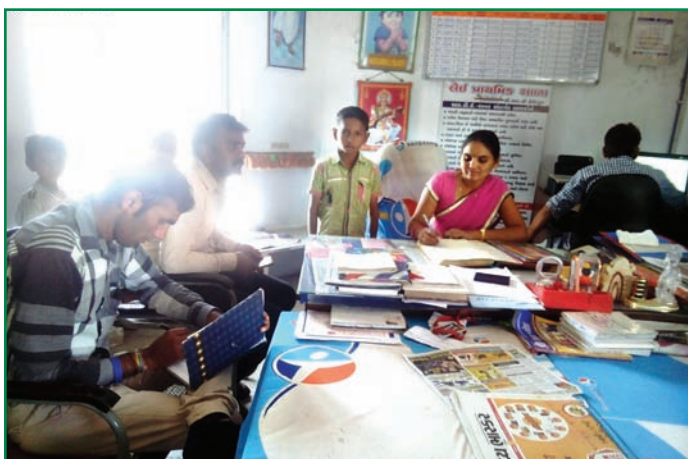
Greet children for their regular attendance in school