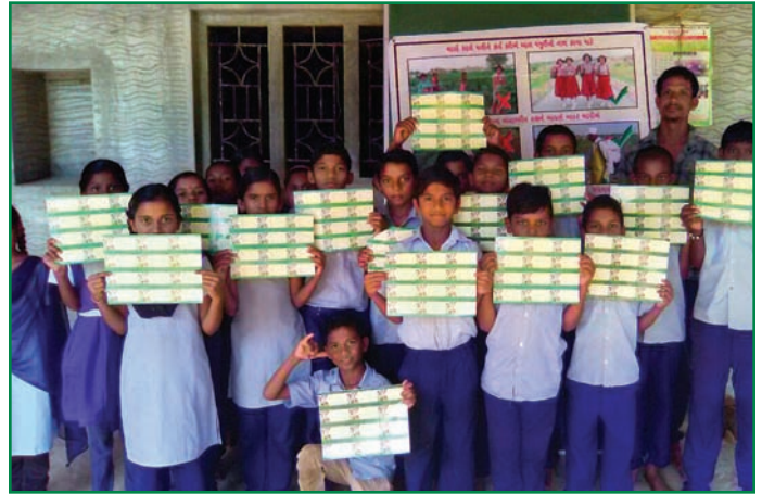
No child labour message through book stickers