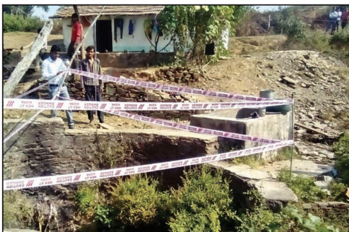
Involve farmers to barricade unsafe conditions

Constant messaging and user-friendly tools lead to an impact