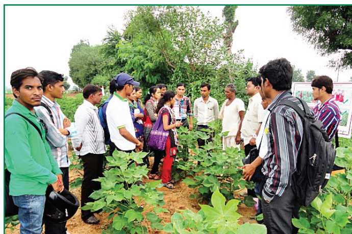
Let team to do role plays in the field