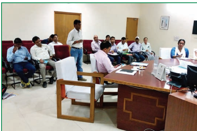
Support government initiatives

Never step out or step back, embrace the challenge