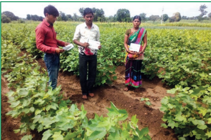
Explaining about ethical business to farmer families