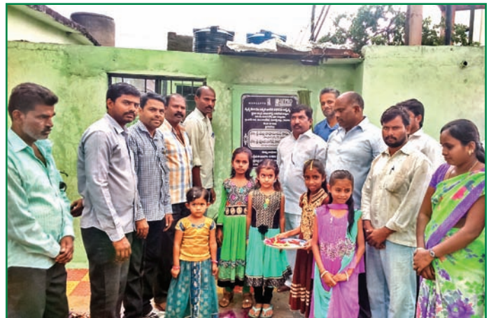
Involve communities in community initiatives