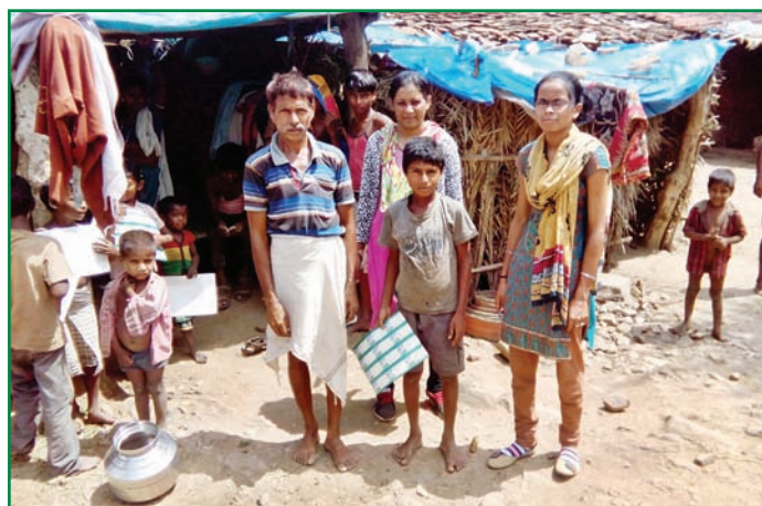
Parents visit to counsel