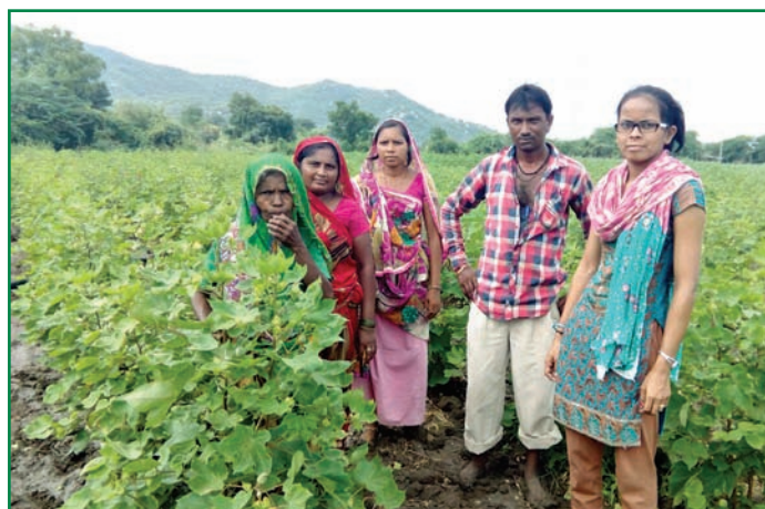
Consistency in approach gives sustained results