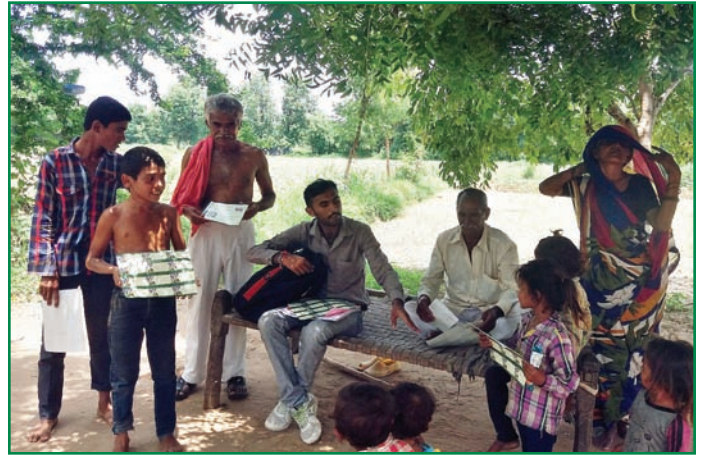
Briefing children about long term implications