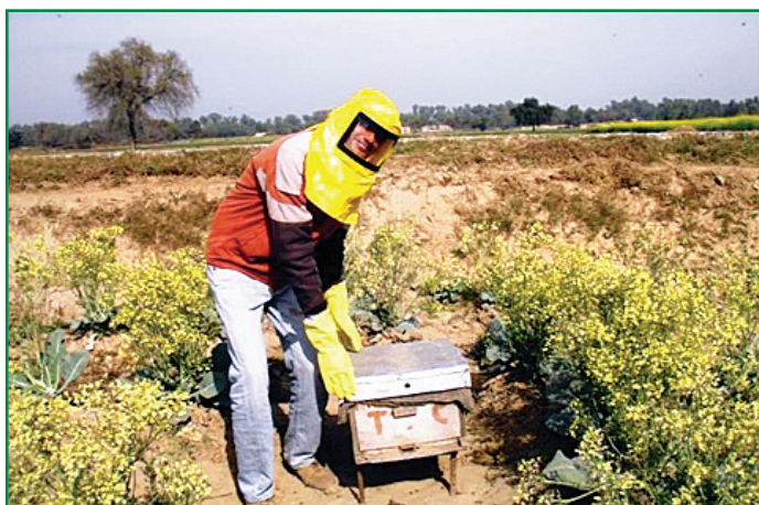
Personal protection for honey bee handling