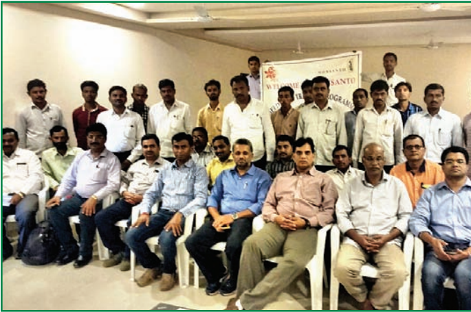
Cross functional team working together