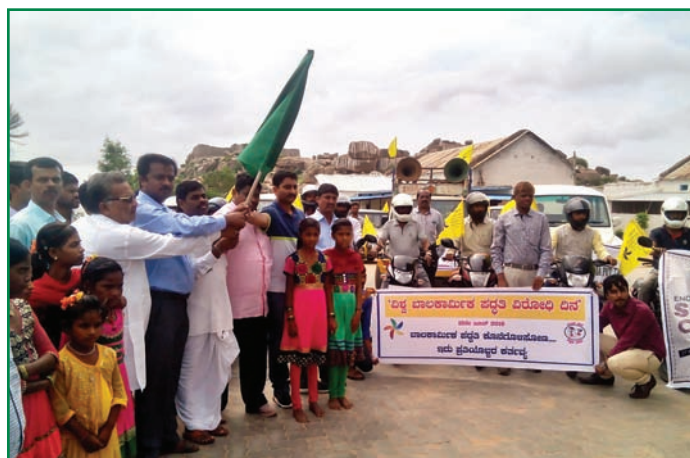
Mobilize communities through mass campaigning