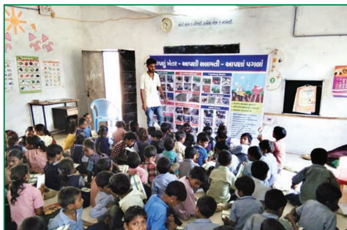
Make children into safety ambassadors