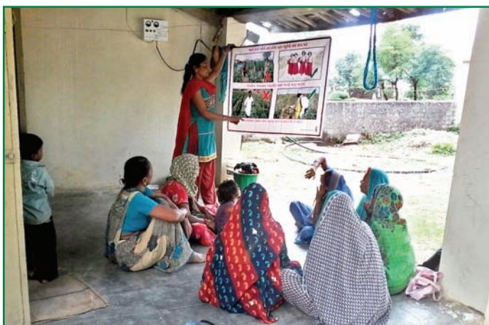
Training for farm labour