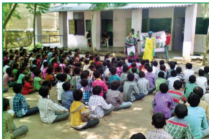
Training for school children