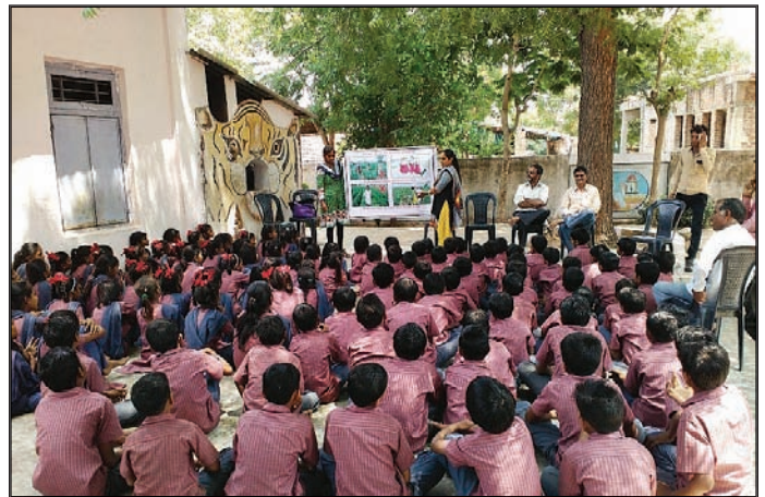
School children and teacher training