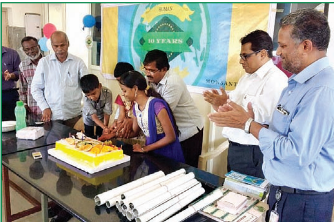
Collaboration with NGOs for new ideas