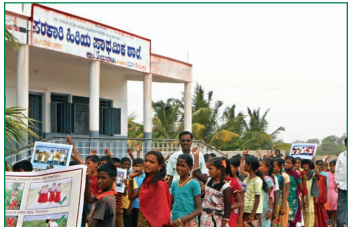
Village processions to create momentum