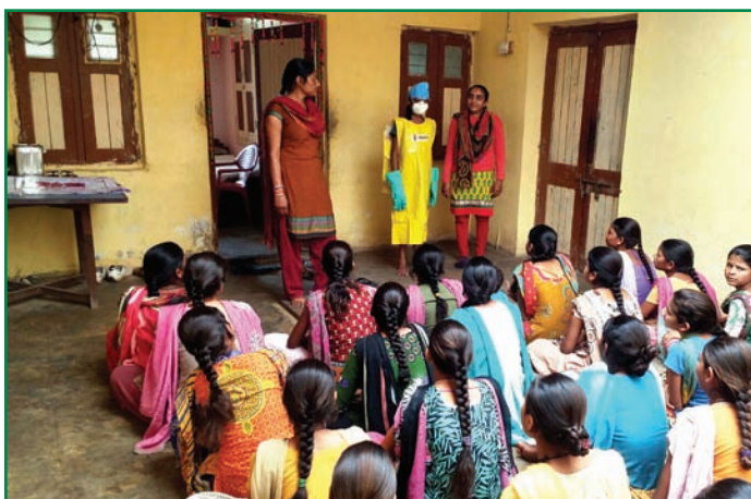
Training for women self help groups