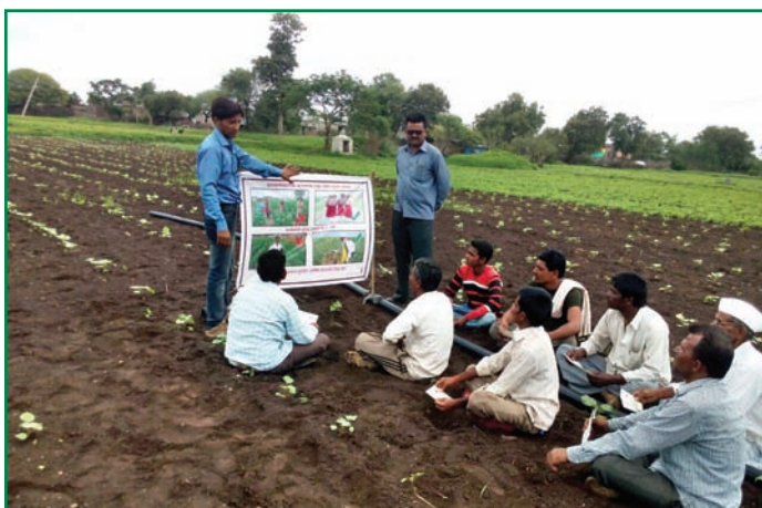
Build confidence to suggest solutions