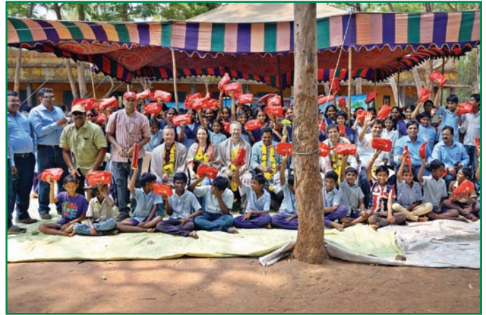
Personal hygiene kits for children