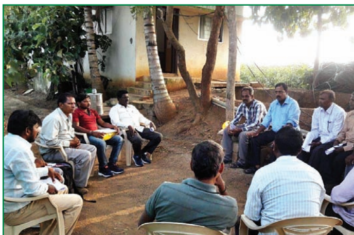
Engage business partners where they are