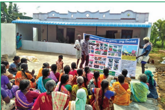
Women and community training