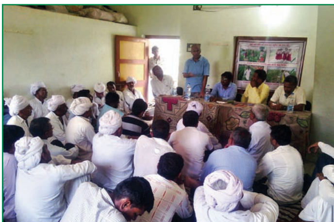
Facilitate discussions with farmers to bring out issues