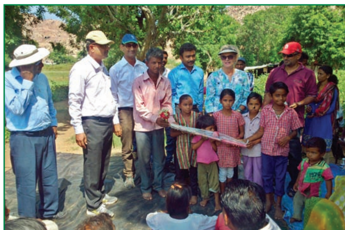
Engage children in sports during school holidays