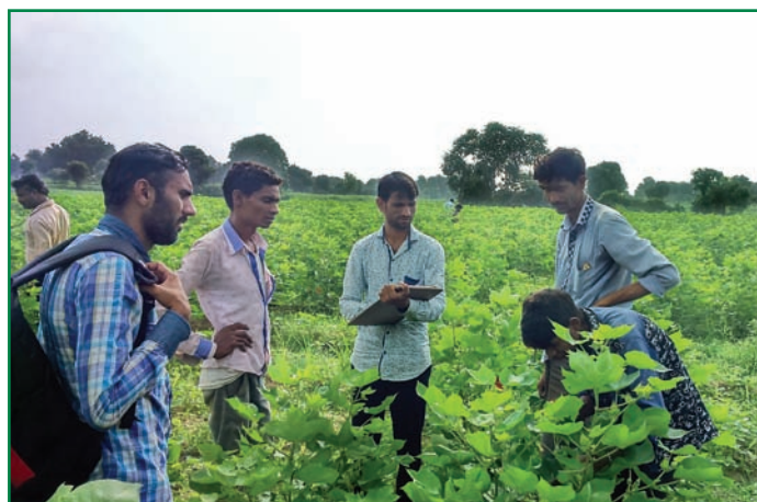
Follow-up to have reliable data