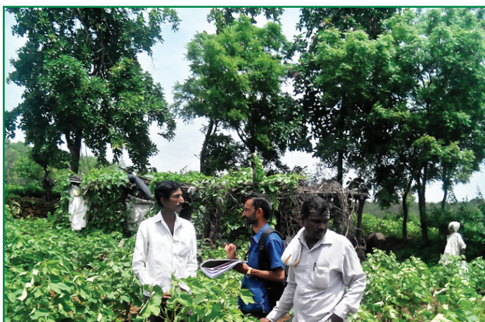
Take views of communities to strategize actions

Bottom-up, Follow-up, Speak –up and never give up