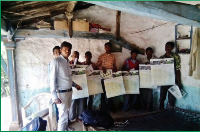
Human Rights Policy in the form of calendars

Need to be audience and situation specific