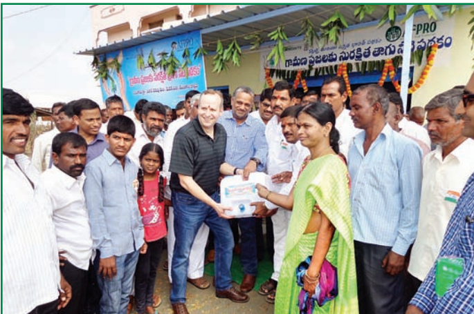
Providing potable water for communities