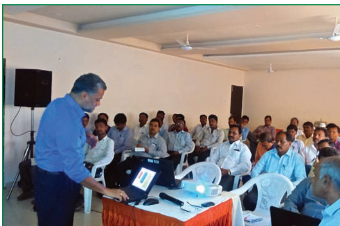
Classroom discussions to bring alignment