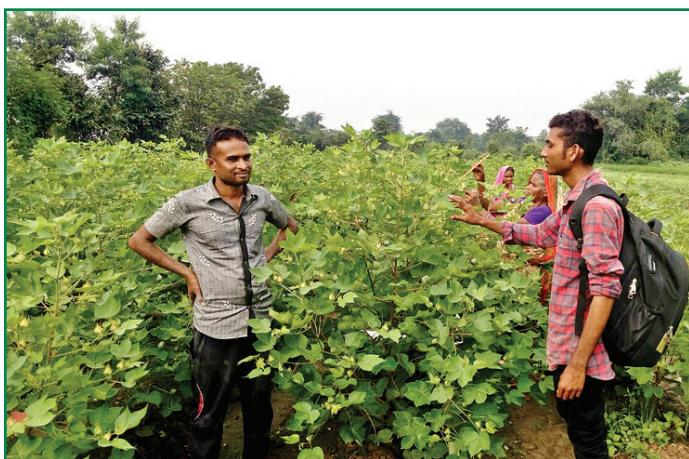
Create an open environment to surface issues