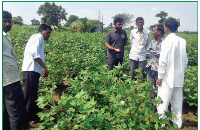
Educating neighboring farmers on code of conduct