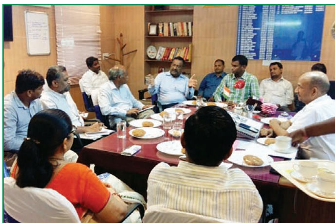
Share program details with other stakeholders