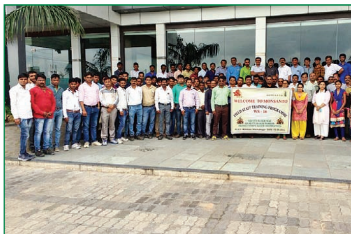
Pre-season training to share last years experiences