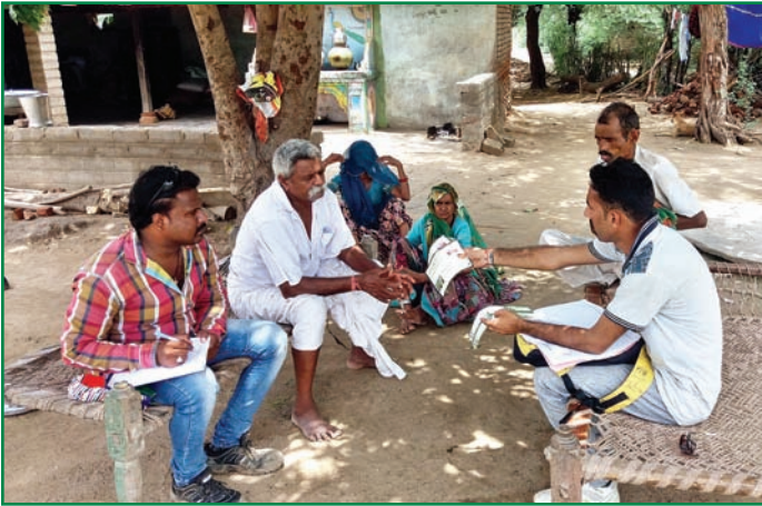
Apprising farmer on policies and local legislation

To behave like an ethical business partner