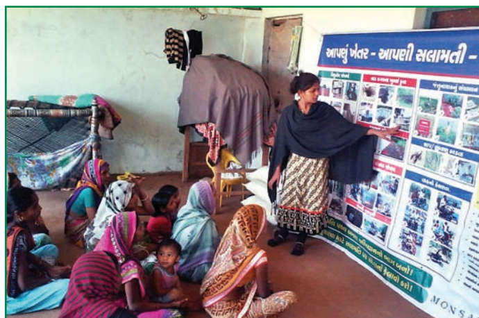
Training for farmer family members