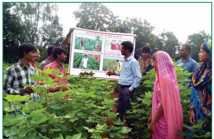
Farmer family training