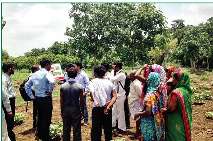
Field orientation matters a lot

Capacity building has a greater importance and impact