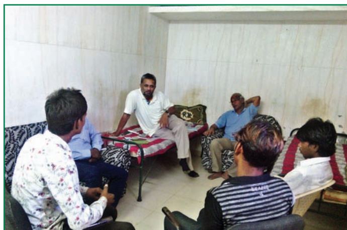
Make labour agents part of the program