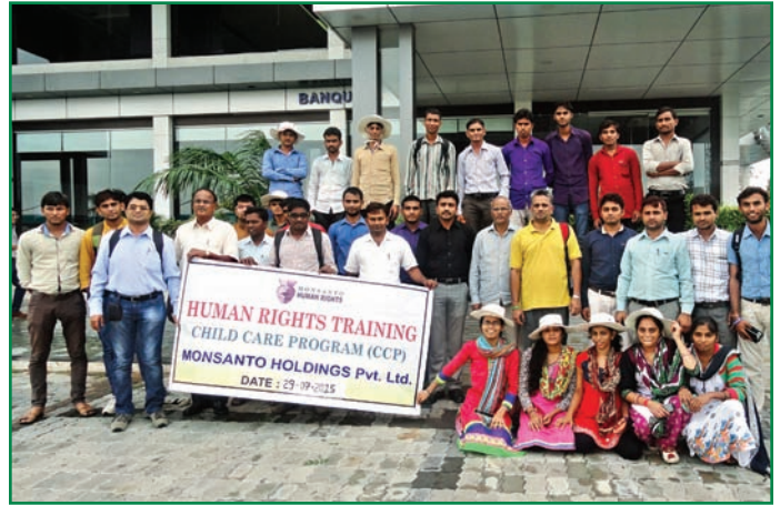
Dedicated team to execute on field