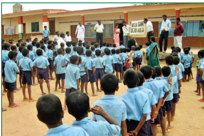
Encourage children to volunteer for change