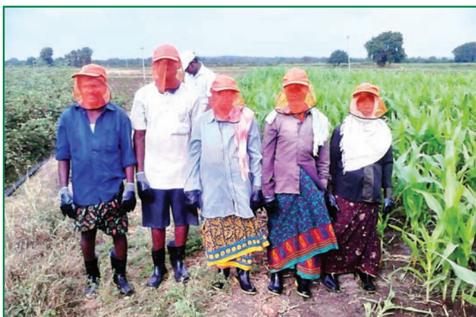
Personal protection for corn labour