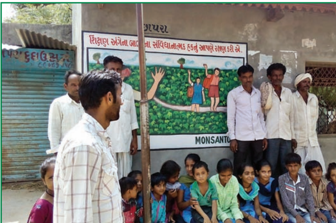
Wall paintings in public places