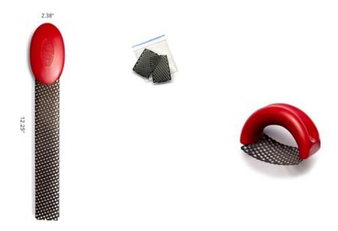
Flat Shredder Small Shredder Small Shredder Replacement Blades

The Small Shredder is an indispensable tool for shaping and carving leather hard clay. For years you could find a tool like this at the hardware store. This type of rasp was originally designed to be used on wood, but clay people, sculptors and auto-body repairmen discovered how well the blade worked on other materials (like clay and auto body filler). The problem was the handle design. The handle would trap clay and get clogged up. Michael designed a new open blade shape as well as a comfortable ergonomic grip. It functions well, doesn't trap the waste clay in the tool and doesn't frustrate the user. An added benefit is the tool mark, it leaves a handsome textured surface in the clay.