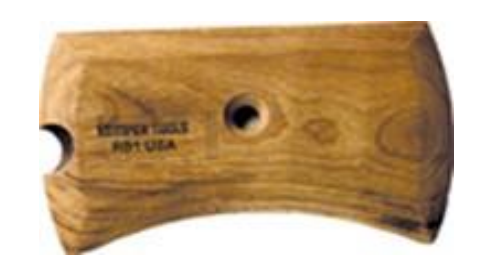
WOOD RIB RB1