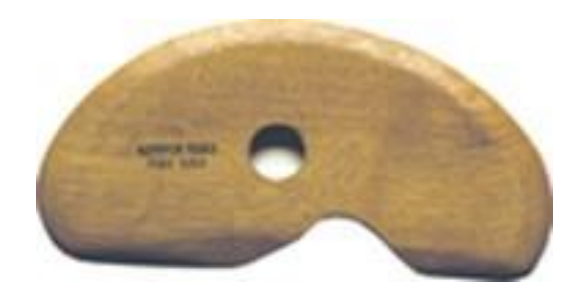
WOOD RIB RB5