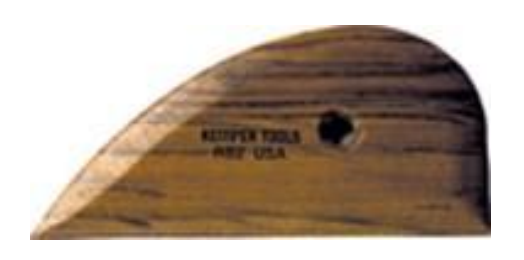
WOOD RIB RB2