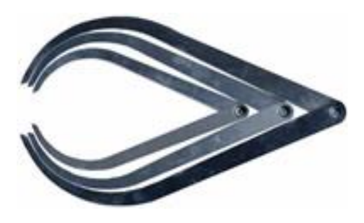
ALUMINUM CALIPERS AL8" SMALL AL10 MEDIUM AL12 LARGE