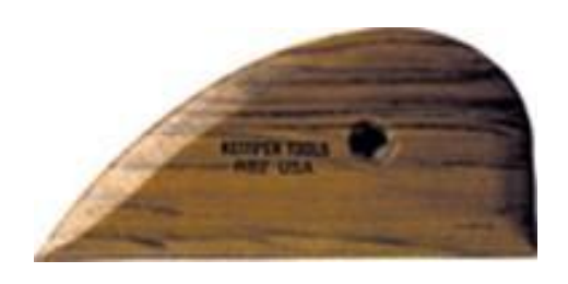
WOOD RIB RB2