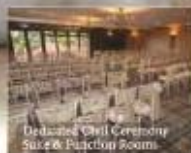
Dedicated Civil Ceremony Suite & Reception Room

Set within the heart of the Eden Valley you can enjoy the picturesque views, stunning surroundings & exclusive use of The Heather Glen Country House for your Wedding Day!