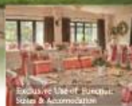
Exclusive Use of Entire House & Accommodation