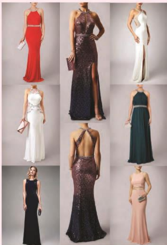
PROM & OCCASION WEAR AT CAROL'S BRIDAL BOUTIQUE