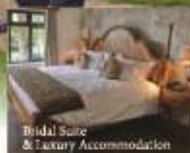
Bridal Suite & Luxury Accommodation