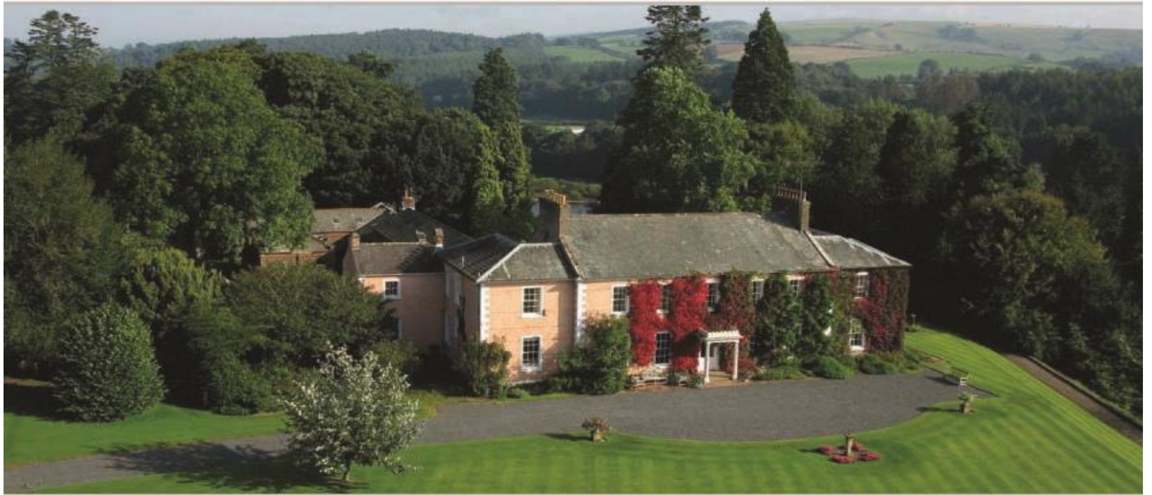
LOW HOUSE, ARMATHWAITE