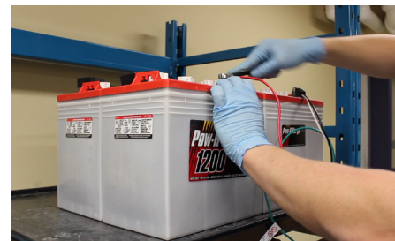
Figure 8: Reattach the positive lead to the positive terminal after disconnecting AC power.