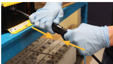
Figure 3: Reconnect AC power to the charger.