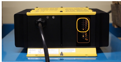
Figure 5: Charge profile #1 on the ammeter.