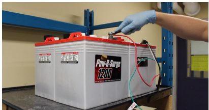
Figure 2: Remove positive lead from positive terminal on the battery pack.