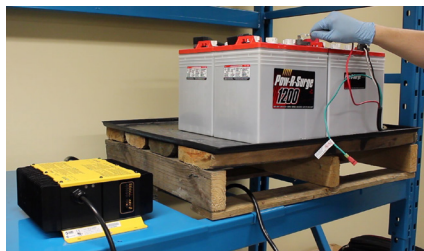
Figure 7: Touch the positive lead to the positive battery terminal for 3 seconds.