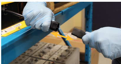
Figure 1: Disconnect AC power.