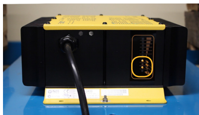
Figure 6: Bulk charge indicator displays charge profiles 7 and above.