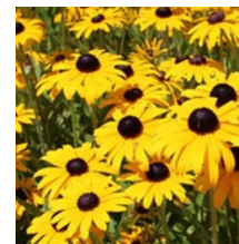
Black Eyed Susan