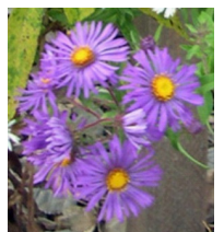
New England Aster