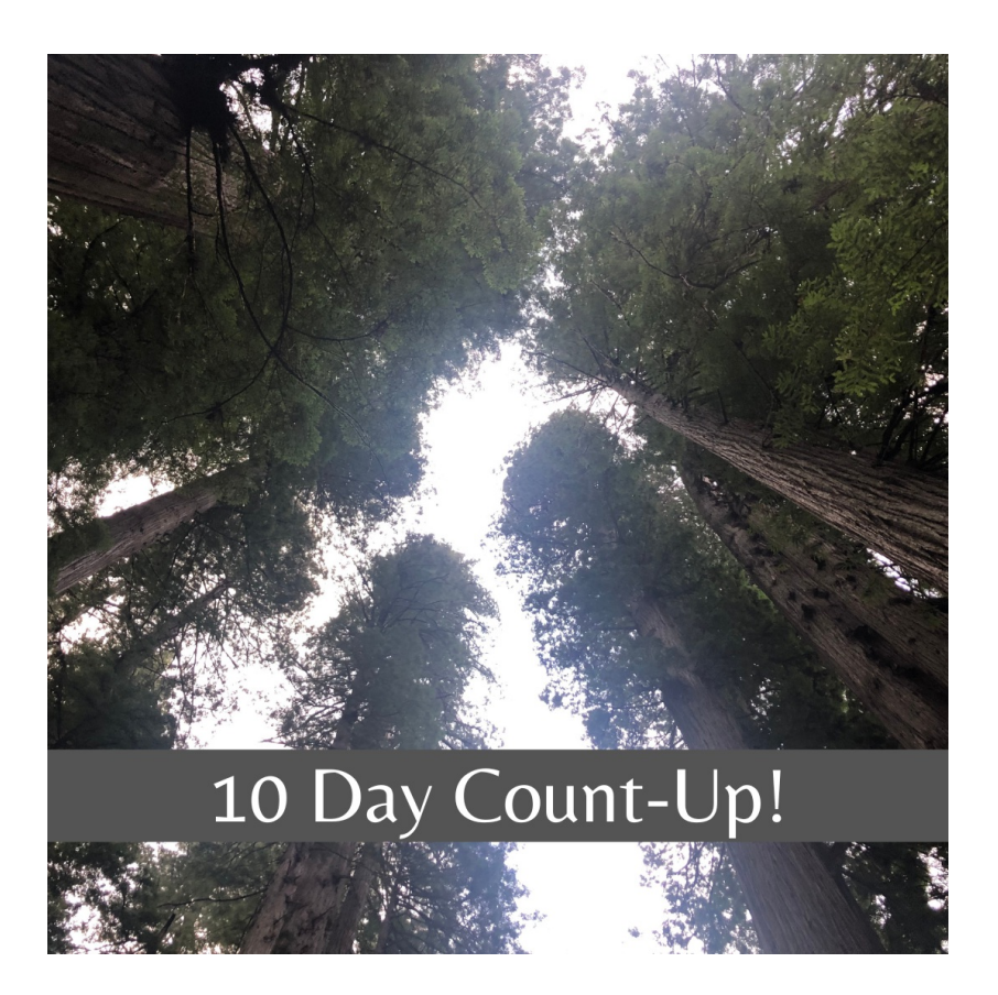
Ascending To The New Year - The 10 Day Count-Up!

Following Winter Solstice's long descent through the shortest day of the year, we begin growing in daylight on December 22. I invite you to join me in embracing the days between the solstice and the new year as a time of renewal and preparation for an amazing 2024. For each of the 10 Day Count-Up! , I will provide a free gift for your wellness toolbox. Each gift carries the intention of helping us to "ascend" to a happier state of mind, body, & spirit as the new year approaches.