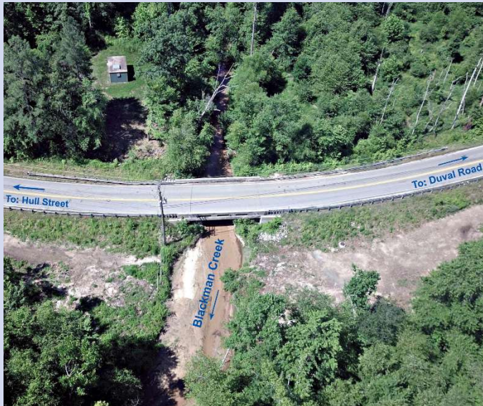
Blackman Creek Proposed Design: Existing Condition