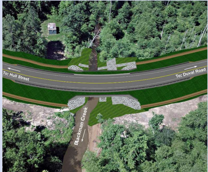
Blackman Creek Proposed Design: Rendering of Proposed Design