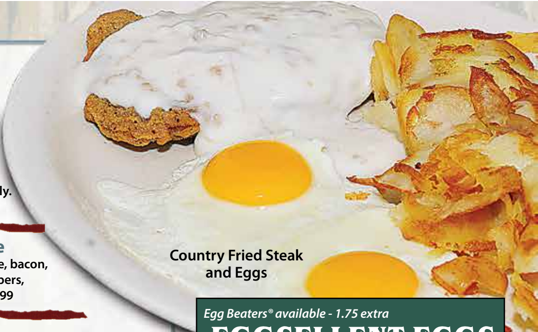
Country Fried Steak and Eggs