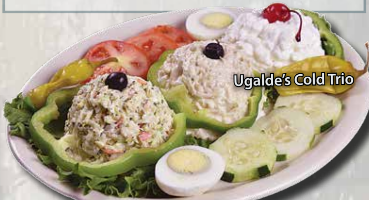
Ugalde's Cold Trio

Potato skins, cheese sticks, breaded mushrooms, chicken strips, onion rings and Buffalo wings. Great choice for sharing! - 11.99