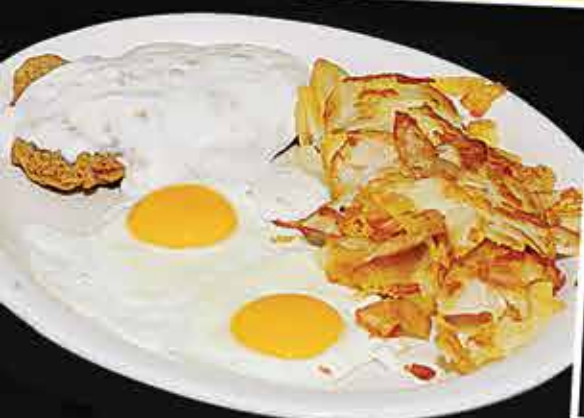
Country Fried Steak and Eggs