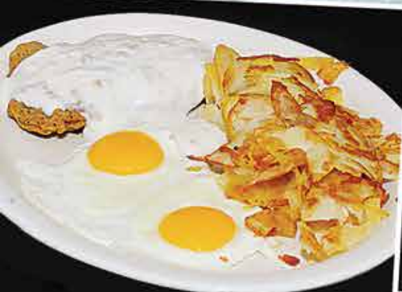
Country Fried Steak and Eggs