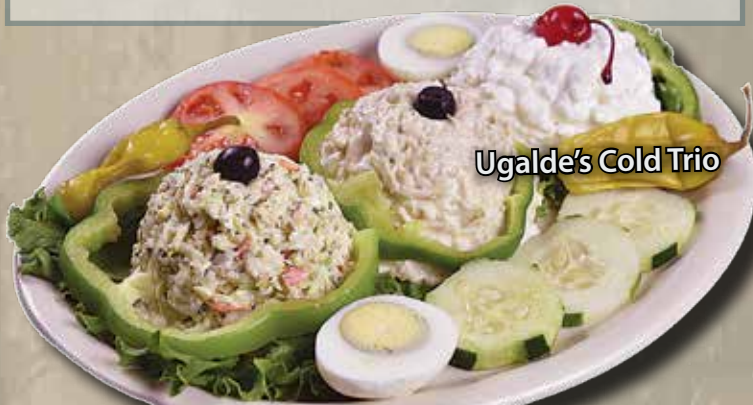
Ugalde's Cold Trio

Potato skins, cheese sticks, breaded mushrooms, chicken strips, onion rings and Buffalo wings. Great choice for sharing! - 10.25