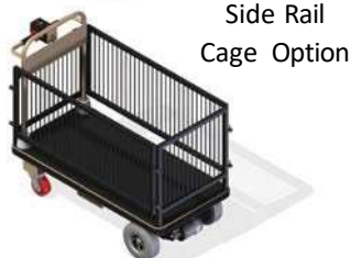
Side Rail Cage Option