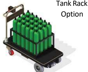
Tank Rack Option