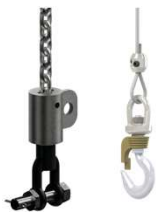
Cable or Chain

E-Float Hoist™ offers flexible options: with or without I/O, cable or chain lift, and a choice of three optional control handles. Please specify handle preference when ordering.