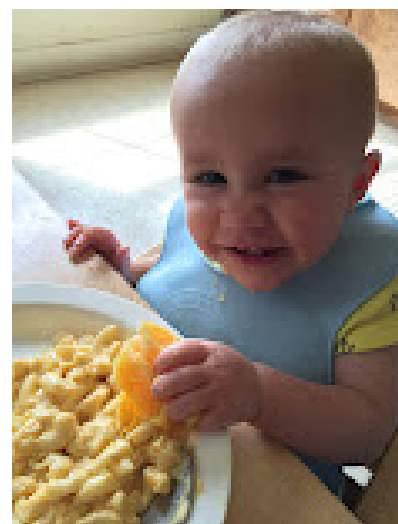
Asher Phillips eating table food at Early Head Start for the first time.