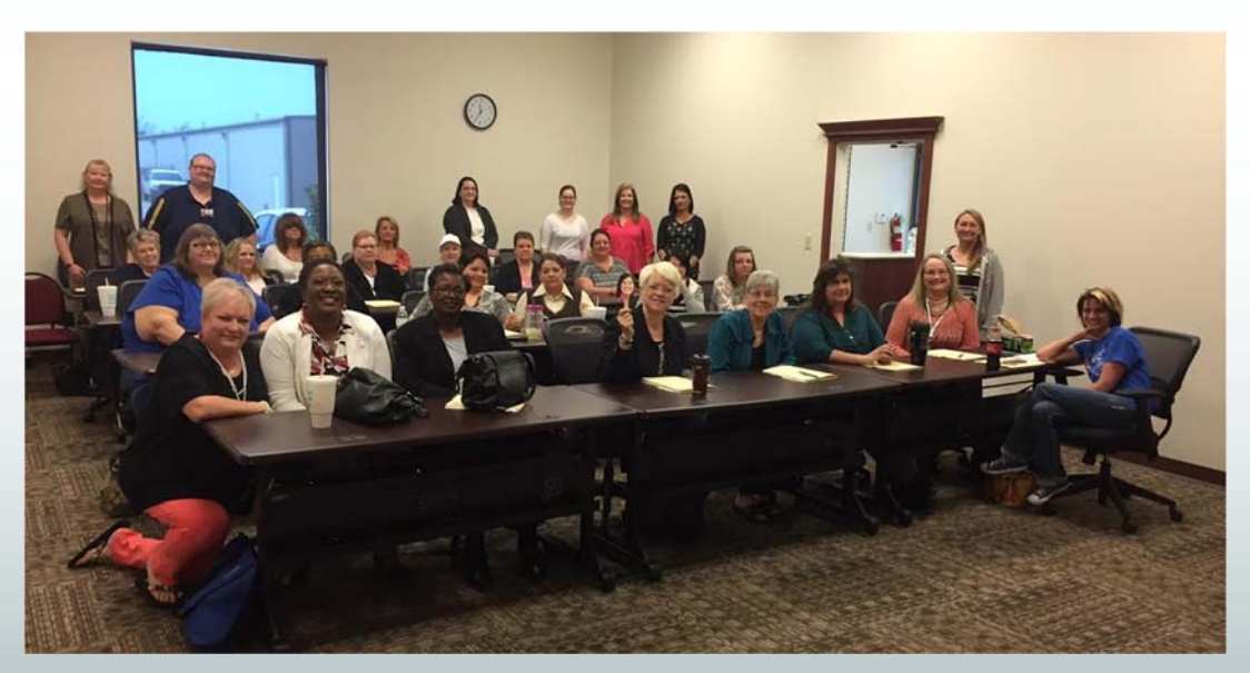
Training for Oklahoma Navigators held at OKCAA facility in Edmond.

476 staff attended 1,840 hours of training.