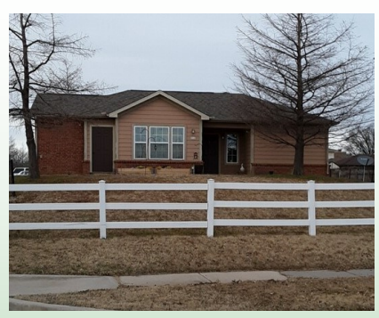
Willow Creek, Ponca City

Cambridge, Sapulpa Copper Ridge, Ponca City Edgewood, Sand Springs, Glenshire, Glenpool, Willow Creek, Ponca City, Pawnee Townhomes Total Units... 370