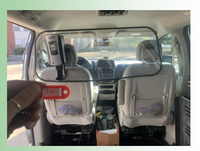
Driver barriers were installed in all vehicles.