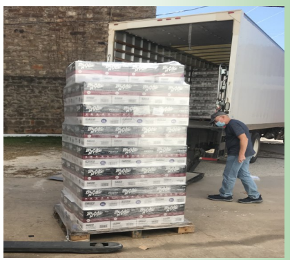
Acrylic barriers and sanitizing dispensers were placed at each site. PPE deliveries year kept employees and riders at reduced risk.