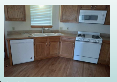
Photo Top Right is a newly renovated 3 bed/2 bath home, 221 NE Sixth Street, Perkins, featuring storm shelter, high energy efficient central HVAC unit and tankless hot water heater. Energy saving, low-flow faucets are installed throughout the home.