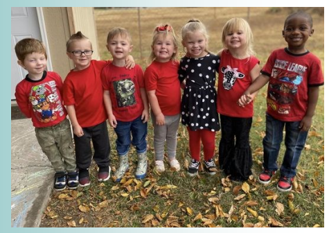
Red Ribbon Day at Beggs Head Start.