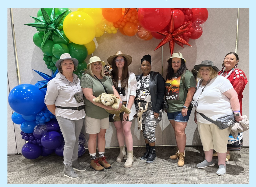
Head Start and Early Head Start In-Service training hosted "Family Vacation" theme day. Photo above: Management Team representing Safari Vacation.