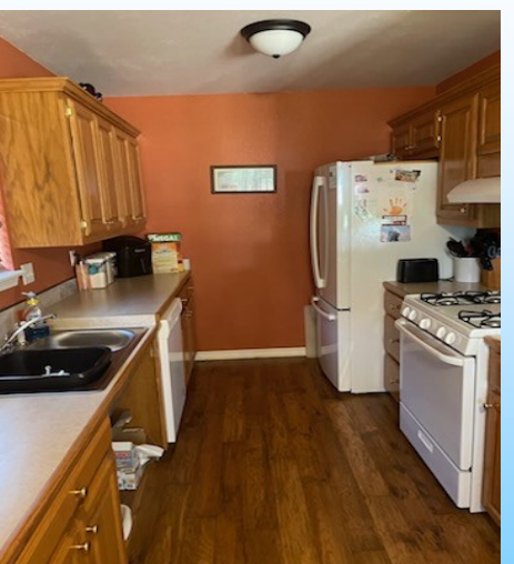
Photo on right are of kitchens of 3 bedroom/2 bath rental units in Perkins. Three units are available, one is designated as ADA with veteran preference.