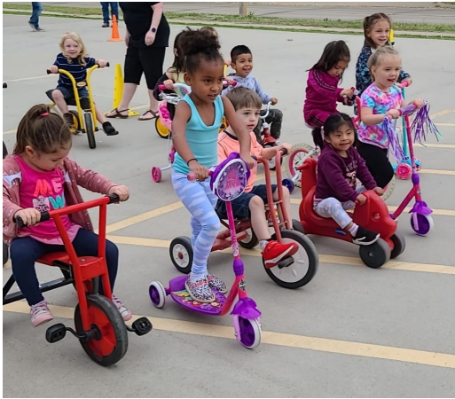
Pictured left: Ponca City Head Start children participated in the annual St. Jude's Trike-a-Thon, a service learning program that teaches trike and riding safety, while helping children of St. Jude.