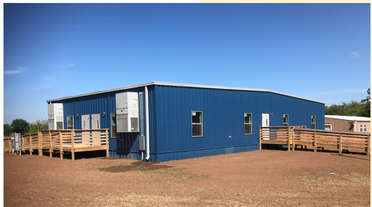
In April, the new Early Head Start Building (pictured above) arrived in Sapulpa. The facility has four classrooms with the ability to serve 32 children.