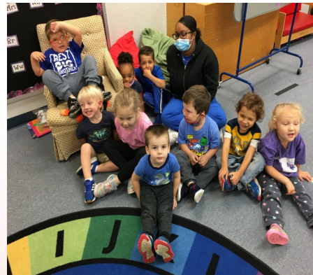
Okmulgee Head Start children.