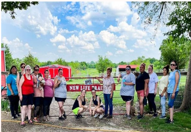
Ponca City Head Start staff (pictured above) completed their Volunteer Day at New Life Trails.

United Community Action Program, Inc. is dedicated to making communities a better place to live. We value the difference that is made from hard work and contributions. Volunteers make such an impact, and we are grateful for what they do for those around them. Featured in the fall newsletter are various ways volunteers and employees of United are giving of themselves and their time to others. Shown are volunteers who plug in through United's programs and partnerships, United employees who dedicate time before or after their formal work, and a United Board member giving time outside of her board service. We are grateful for all of you, and we hope to connect as we work alongside of you to make change in our communities.