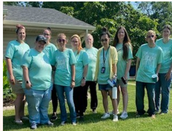
Pictured above, Stillwater Head Start staff gave back to the community on June 2, by assisting residents at Meltose Place with yard clean-up projects.