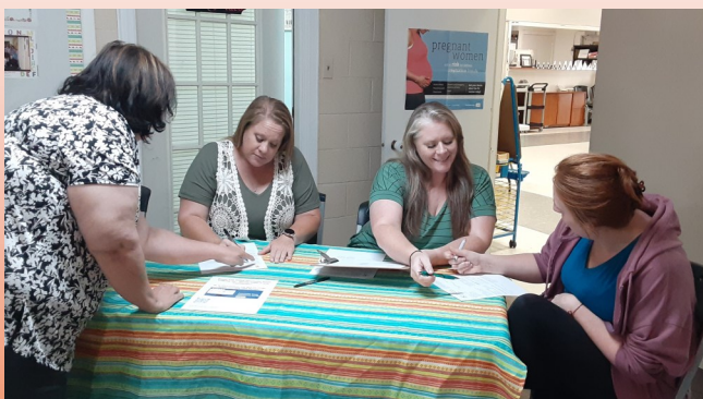
Sapulpa Head Start Parent Meet 'n Greet Day , August 15.